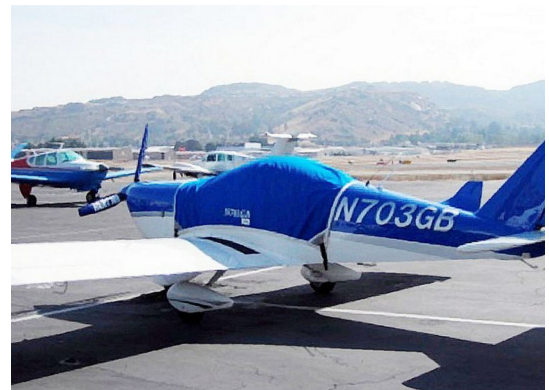
Gobosh 700S Canopy Cover (comes in colors)