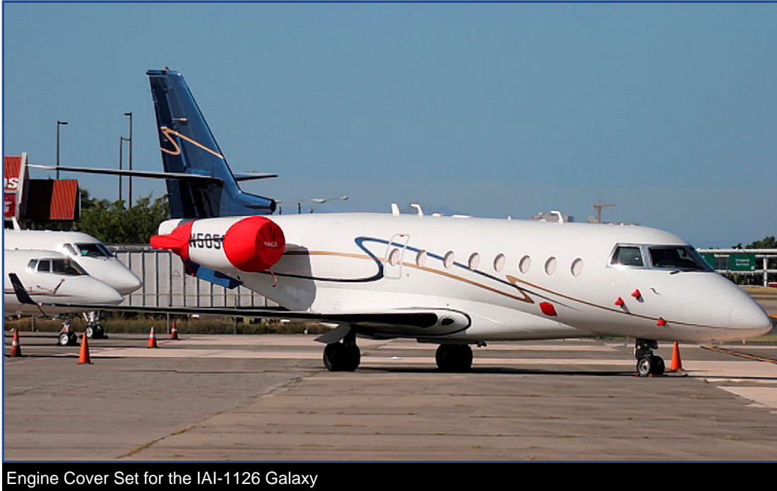
Engine Cover Set for the IAI-1126 Galaxy