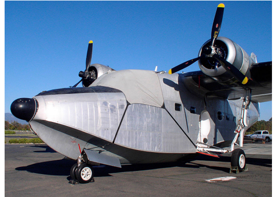
Canopy Cover for the Grumman HU-16 Albatross