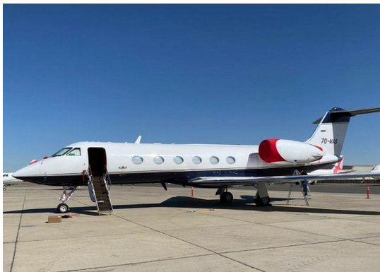
Grumman Gulfstream G-IV SP Engine Cover, bikini type

The Gulfstream Aerospace Gulfstream GVII (G400, G500, G600, G700, G800) Bikini Style Engine Covers are a single-piece design using a soft and smooth stretchy fabric. The cover stretches tightly over both the intake and exhaust, installing quickly and easily. These covers are designed to be used as hangar dust covers and have a useful life of approximately one year.