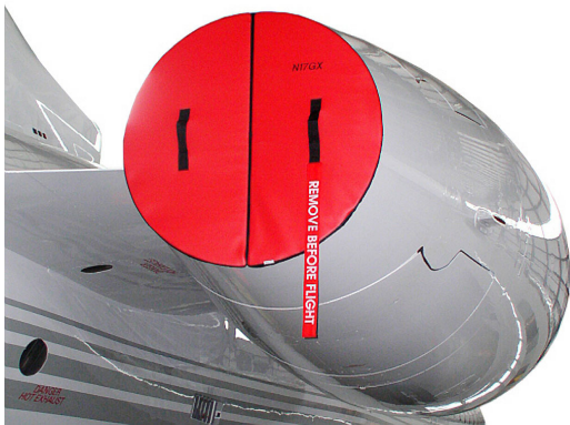
Global Express Exhaust Plugs

The Engine Inlet Plugs are custom fit for your Gulfstream Aerospace Gulfstream GVII (G400, G500, G600, G700, G800) intakes, made with heavy-duty vinyl material, and stuffed with a single block of sculpted urethane foam. Each plug has a zipper that allows the foam to be removed and dried if necessary. Engine plugs have 'remove before flight' streamers sewn onto the face of the plugs. Most plugs are imprinted with the aircraft registration number in black for an extra charge. Storage bag NOT included. Engine plugs may be inserted after flight when the engine is still warm. Engine Inlet Plugs are commonly referred to as Cowl Plugs, Intake Plugs, Cowl Blocks, Engine Blocks, and Engine Bungs.