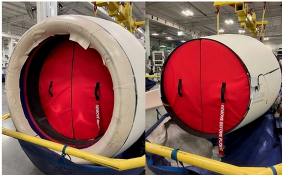
Gulfstream G500 FOD protection plugs for mfg process