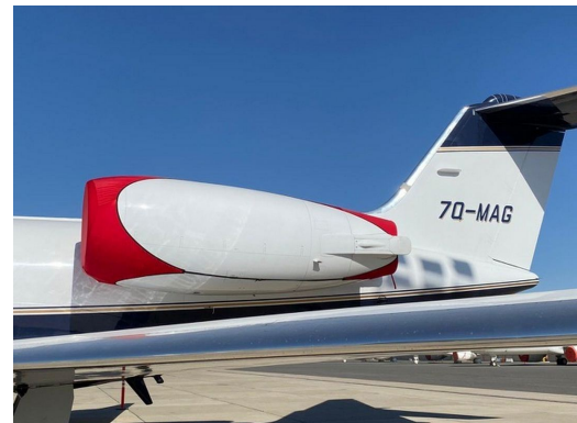
Grumman Gulfstream G-IV SP Engine Cover, bikini type