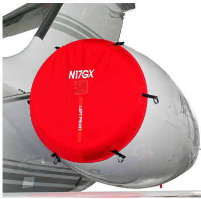
Bombardier Global Express Intake Covers