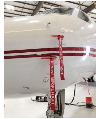
Grumman Gulfstream G-V Pitot Covers