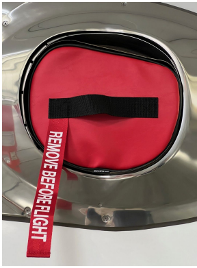
Gulfstream V APU Exhaust Plug