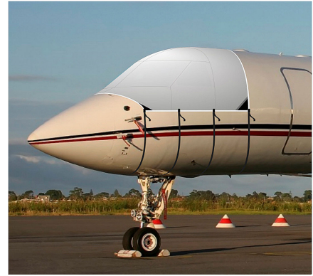
G-V Cockpit/Windshield Cover (Illustration)