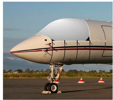
G-V Cockpit/Windshield Cover (Illustration)