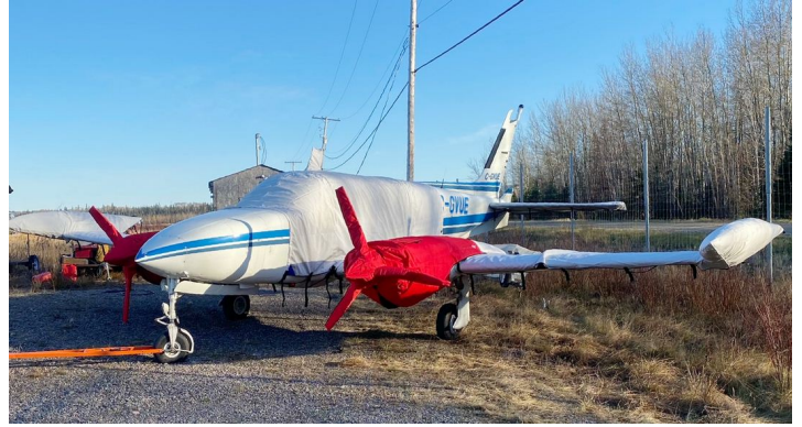
Cessna 340A Extended Canopy, Wing, Insulated Engine & Prop Covers