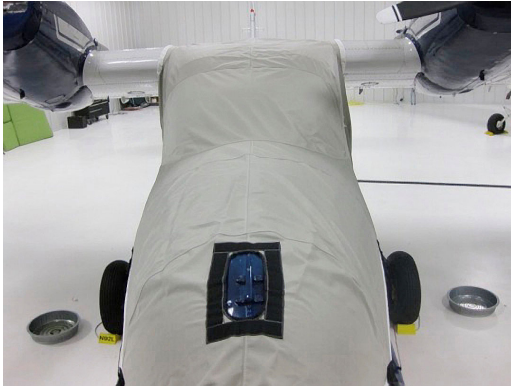
Grumman Widgeon Cockpit/Nose Cover, tie-down cleat detail

This cover type is made from Silver Acrylic Sunbrella canvas and is 100% lined with a soft and smooth microfiber. Bruce's Custom Covers developed this material combination especially for aircraft protection. The outer material is medium weight and treated for water resistance, UV resistance and anti-static buildup. The inner lining is a very soft and smooth microfiber to prevent scratching. The material is very reflective, and tests show that the cabin interior temperature can be reduced to near-ambient temperature on the hottest of days. It is water, ice and snow repellent, yet breathable to allow moisture to escape from between the cover and the aircraft surface.