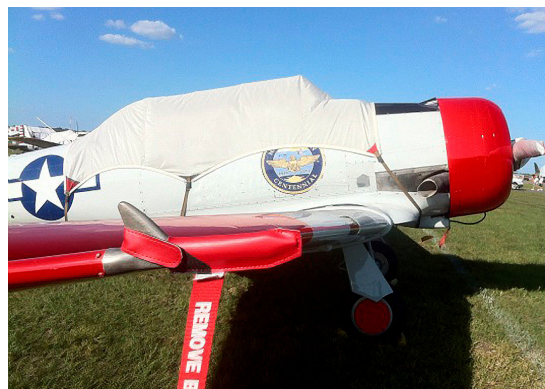
T6 Pitot, Canopy & Prop Covers

Grumman Widgeon G-44 Pitot Tube Covers , NOT HEAT RESISTANT TYPE, are made of Naugahyde vinyl, and are designed to cover the entire pitot assembly. Slipping over the tube, the cover tightens around the base with a Velcro strap detail. A "Remove Before Flight" streamer is attached to the cover. Heat Resistant Pitot Covers are an upgrade to this design, and help prevent the pitot cover from melting onto the tube if the pitot heat is accidentally turned on while installed. If you want the set tethered together, please let us know.