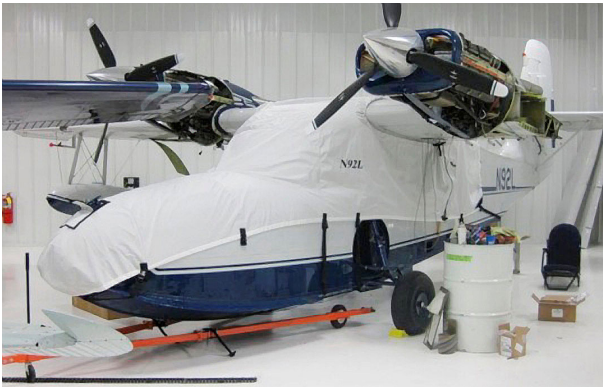
Grumman G44 Widgeon Canopy/Nose Cover

Travel Covers are made with Silver Solution-Dyed Polyester fabric and only lined over the windshield to save weight. The material is lightweight and more compact for easy stowage in the aircraft. The polyester material is water resistant, but only intended for occasional use outside. We also have an ultra lightweight material available for fitted hangar dust covers. For daily outdoor use, the non-travel Sunbrella Cover is the best choice.