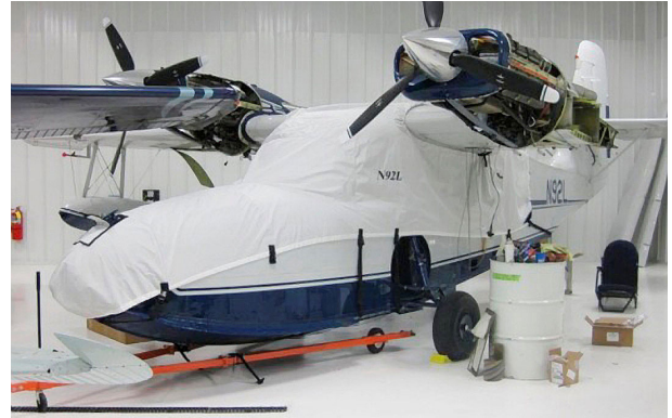
Grumman G44 Widgeon Canopy/Nose Cover