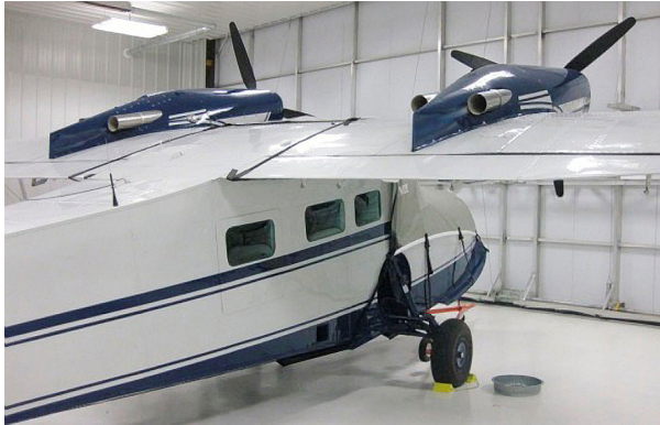
Grumman G44 Widgeon Cockpit/Nose Cover

This cover type is made from Silver Acrylic Sunbrella canvas and is 100% lined with a soft and smooth microfiber. Bruce's Custom Covers developed this material combination especially for aircraft protection. The outer material is medium weight and treated for water resistance, UV resistance and anti-static buildup. The inner lining is a very soft and smooth microfiber to prevent scratching. The material is very reflective, and tests show that the cabin interior temperature can be reduced to near-ambient temperature on the hottest of days. It is water, ice and snow repellent, yet breathable to allow moisture to escape from between the cover and the aircraft surface.