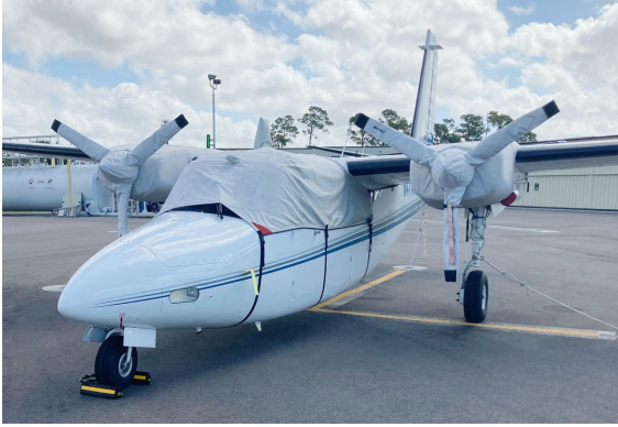
Aero Commander 500S Shrike Canopy, Engine & Prop Covers

The material is very reflective, and tests show that the cabin interior temperature can be reduced to near-ambient temperature on the hottest of days. It is water, ice and snow repellent, yet breathable to allow moisture to escape from between the cover and the aircraft surface.