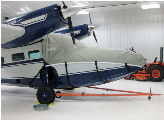
Grumman G44 Widgeon Cockpit/Nose Cover

Travel Covers are made with Silver Solution-Dyed Polyester fabric and only lined over the windshield to save weight. The material is lightweight and more compact for easy stowage in the aircraft. The polyester material is water resistant, but only intended for occasional use outside. We also have an ultra lightweight material available for fitted hangar dust covers. For daily outdoor use, the non-travel Sunbrella Cover is the best choice.