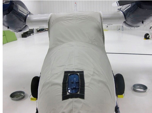
Grumman Widgeon Cockpit/Nose Cover, tie-down cleat detail