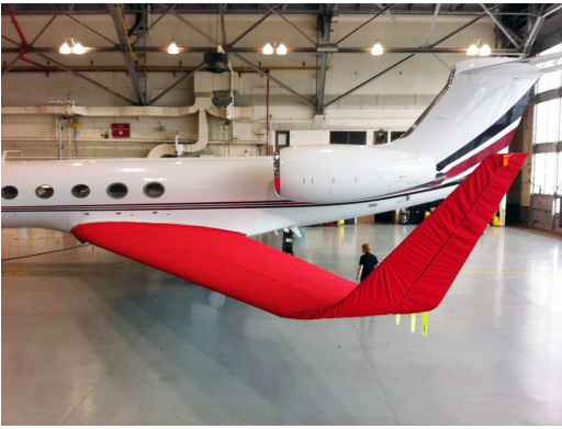
Gulfstream G550 Wing/Winglet Covers