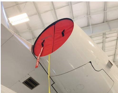
Grumman Gulfstream G-V Exhaust Plugs

The Engine Inlet Plugs are custom fit for your Gulfstream Aerospace Gulfstream IV (C-20G), G350, G450 intakes, made with heavy-duty vinyl material, and stuffed with a single block of sculpted urethane foam. Each plug has a zipper that allows the foam to be removed and dried if necessary. Engine plugs have 'remove before flight' streamers sewn onto the face of the plugs. Most plugs are imprinted with the aircraft registration number in black for an extra charge. Storage bag NOT included. Engine plugs may be inserted after flight when the engine is still warm. Engine Inlet Plugs are commonly referred to as Cowl Plugs, Intake Plugs, Cowl Blocks, Engine Blocks, and Engine Bunges.