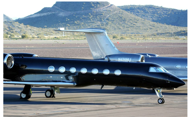
Gulfstream Cockpit Heatshields