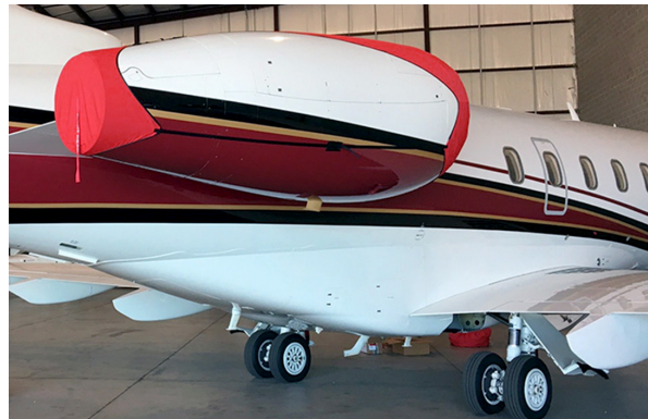
Intake/Exhaust Covers, 3-Strap Type. Successfully installed by two crew, one ladder.