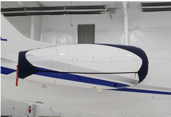
Challenger 300 Intake/Exhaust Cover Set, 3-strap type

The Gulfstream Aerospace Gulfstream IV (C-20G), G350, G450 Intake Covers are designed to install easily yet be completely storable. A spring steel hoop is sewn into the hem of each cover, allowing them to be installed without climbing onto the wing or using a stepladder. To store the covers the spring steel hoop folds like a band-saw blade into three nesting rings. Each cover folds into a compact circular bundle which is stored in the included duffle bag, yet they unfold quickly for use. The Tri-Fold Ring cover is made of medium weight nylon which is available in a variety of colors to match the paint trim. Each cover set comes complete with installation and folding instructions. The aircraft's registration number can be silkscreened onto the cover for an extra charge.