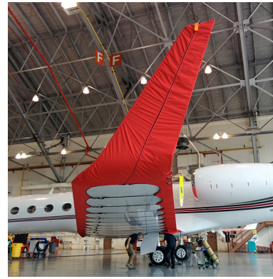
Gulfstream G550 Wing/Winglet Covers