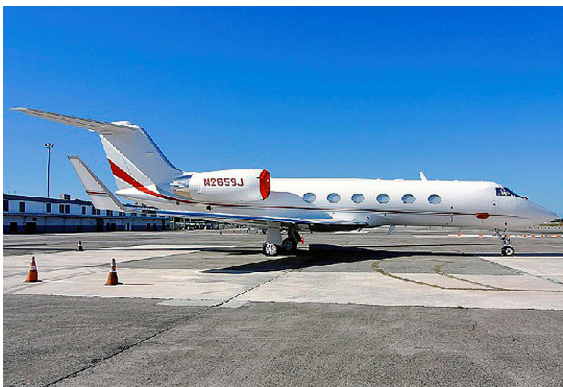
Gulfstream G-IV Intake Covers

The Gulfstream Aerospace Gulfstream IV (C-20G), G350, G450 Intake Covers are designed to install easily yet be completely storable. A spring steel hoop is sewn into the hem of each cover, allowing them to be installed without climbing onto the wing or using a stepladder. To store the covers the spring steel hoop folds like a band-saw blade into three nesting rings. Each cover folds into a compact circular bundle which is stored in the included duffle bag, yet they unfold quickly for use. The Tri-Fold Ring cover is made of medium weight nylon which is available in a variety of colors to match the paint trim. Each cover set comes complete with installation and folding instructions. The aircraft's registration number can be silkscreened onto the cover for an extra charge.