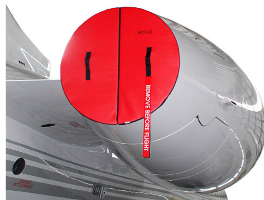
Grumman Gulfstream Exhaust Plugs, folding type