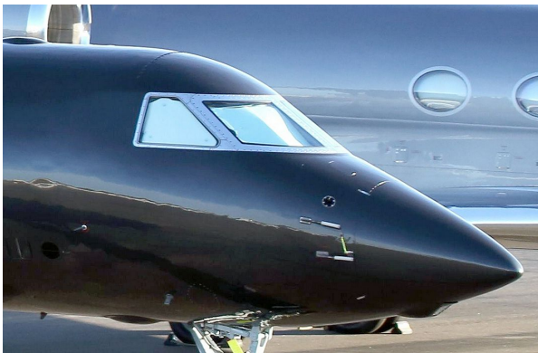
Gulfstream Cockpit Heatshields

Cockpit Heatshields are interior sunshades for the aircraft's cockpit. The product is a unique composite of closed-cell foam with a silver mylar finish. The semi-rigid design is stiff enough to stand inside the window framing. The set folds up flat and is easily stored in the included storage sleeve. Some designs may require velcro and suction cups. Our Heatshields for jets are offered white side out because some aircraft manufacturers have issued advisories against reflective window inserts due to potential heat damage. A Heatshield is an excellent short-term remedy for cockpit overheating, but an external fabric cover is more effective for long-term protection.