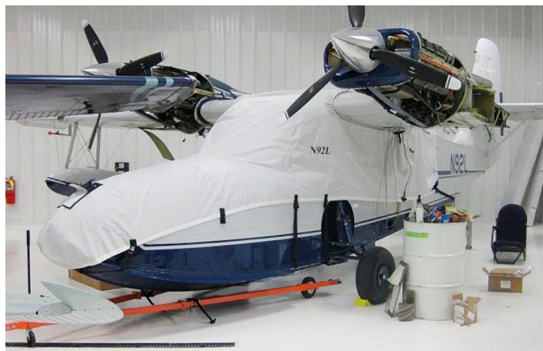
Grumman G44 Widgeon Canopy/Nose Cover