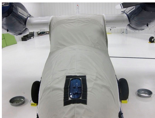
Grumman Widgeon Cockpit/Nose Cover, tie-down cleat detail