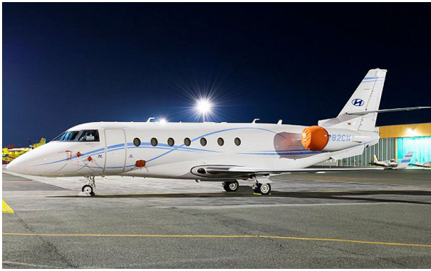
Gulfstream 200 Intake Covers