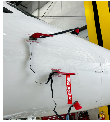
Gulfstream GVII Pitot Probes/TAT/Ice Detector Set, Heat Resistant Type