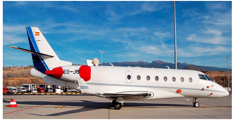
Gulfstream 200 Engine Cover set