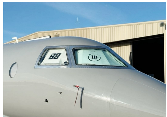
Gulfstream G200 Cockpit Heatshields