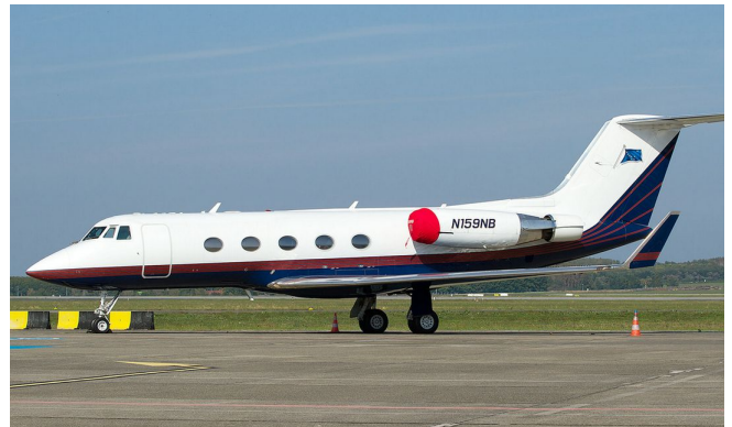
Grumman Gulfstream II Intake Covers