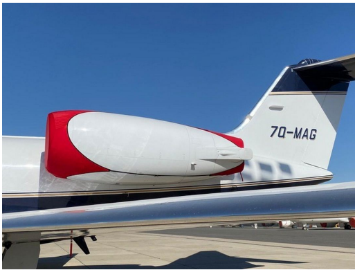
Grumman Gulfstream G-IV SP Engine Cover, bikini type

The Gulfstream Aerospace Gulfstream II, III (C-20D) Intake Covers are designed to install easily yet be completely storable. A spring steel hoop is sewn into the hem of each cover, allowing them to be installed without climbing onto the wing or using a stepladder. To store the covers the spring steel hoop folds like a band-saw blade into three nesting rings. Each cover folds into a compact circular bundle which is stored in the included duffle bag, yet they unfold quickly for use. The Tri-Fold Ring cover is made of medium weight nylon which is available in a variety of colors to match the paint trim. Each cover set comes complete with installation and folding instructions. The aircraft's registration number can be silkscreened onto the cover for an extra charge.