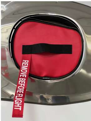
Gulfstream V APU Exhaust Plug