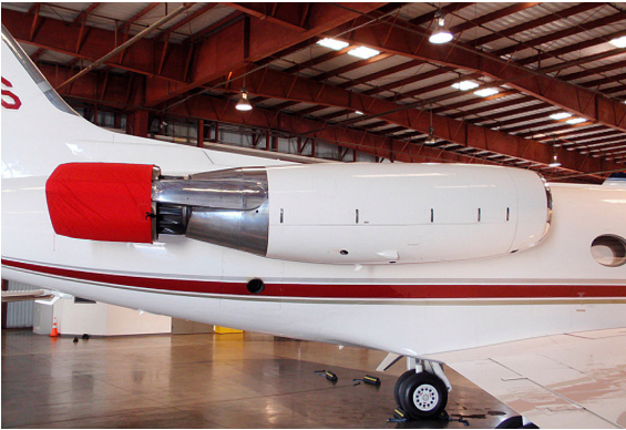
Stage III Quiet Technologies Hush Kit Cover