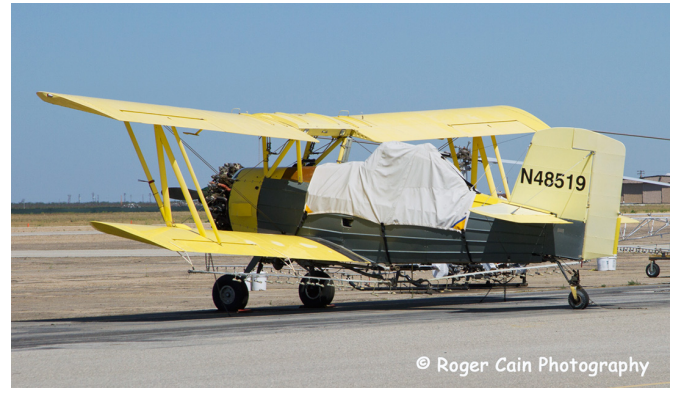
Grumman AG Cat Canopy Cover