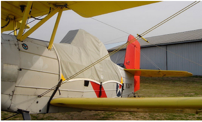
Ag-Cat Canopy Cover