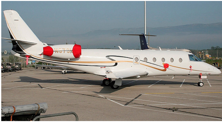
Engine Cover Set