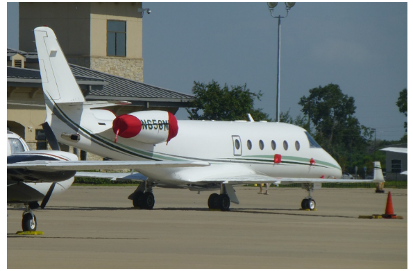
Gulfstream G150 Engine Cover Set