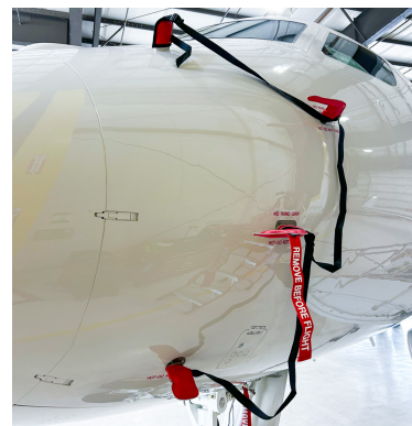
Gulfstream GVII Pitot Probes/TAT/Ice Detector Set, Heat Resistant Type