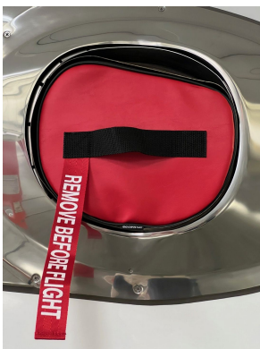
Gulfstream V APU Exhaust Plug

The Engine Inlet Plugs are custom fit for your Gulfstream Aerospace Gulfstream G150 intakes, made with heavy-duty vinyl material, and stuffed with a single block of sculpted urethane foam. Each plug has a zipper that allows the foam to be removed and dried if necessary. Engine plugs have 'remove before flight' streamers sewn onto the face of the plugs. Most plugs are imprinted with the aircraft registration number in black for an extra charge. Storage bag NOT included. Engine plugs may be inserted after flight when the engine is still warm. Engine Inlet Plugs are commonly referred to as Cowl Plugs, Intake Plugs, Cowl Blocks, Engine Blocks, and Engine Bungs.