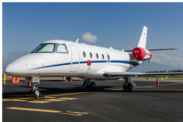
Gulfstream G150 Engine Covers, Cockpit HeatShields

Cockpit Heatshields are interior sunshades for the aircraft's cockpit. The product is a unique composite of closed-cell foam with a silver mylar finish. The semi-rigid design is stiff enough to stand inside the window framing. The set folds up flat and is easily stored in the included storage sleeve. Some designs may require velcro and suction cups. Our Heatshields for jets are offered white side out because some aircraft manufacturers have issued advisories against reflective window inserts due to potential heat damage. A Heatshield is an excellent short-term remedy for cockpit overheating, but an external fabric cover is more effective for long-term protection.