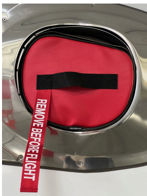
Gulfstream V APU Exhaust Plug

The Engine Inlet Plugs are custom fit for your Gulfstream Aerospace Gulfstream G150 intakes, made with heavy-duty vinyl material, and stuffed with a single block of sculpted urethane foam. Each plug has a zipper that allows the foam to be removed and dried if necessary. Engine plugs have 'remove before flight' streamers sewn onto the face of the plugs. Most plugs are imprinted with the aircraft registration number in black for an extra charge. Storage bag NOT included. Engine plugs may be inserted after flight when the engine is still warm. Engine Inlet Plugs are commonly referred to as Cowl Plugs, Intake Plugs, Cowl Blocks, Engine Blocks, and Engine Bungs.