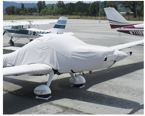
Grob 109 Prop Cover