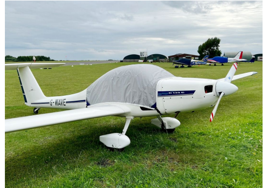
Grob 109 Travel Cover, Light Weight Canopy Cover