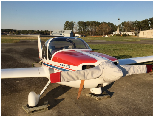
Grob 109 Prop Cover