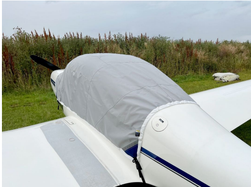
Grob 109 Travel Cover, Light Weight Canopy Cover