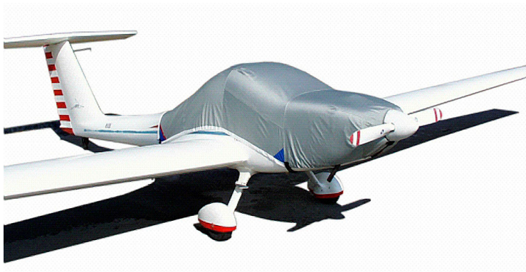
Grob 109 Canopy/Engine Cover