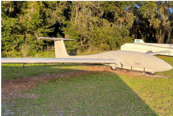
Burkhart Grob G 103 TWIN II Canopy/Nose Cover (overlaps with empennage cover) all year use