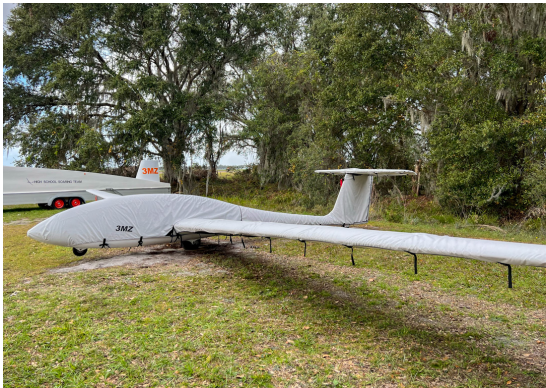
Burkhart Grob G 103 TWIN II Complete Cover Set

This cover type is made from Silver Acrylic Sunbrella canvas and is 100% lined with a soft and smooth microfiber. Bruce's Custom Covers developed this material combination especially for aircraft protection. The outer material is medium weight and treated for water resistance, UV resistance and anti-static buildup. The inner lining is a very soft and smooth microfiber to prevent scratching. The material is very reflective, and tests show that the cabin interior temperature can be reduced to near-ambient temperature on the hottest of days. It is water, ice and snow repellent, yet breathable to allow moisture to escape from between the cover and the aircraft surface.