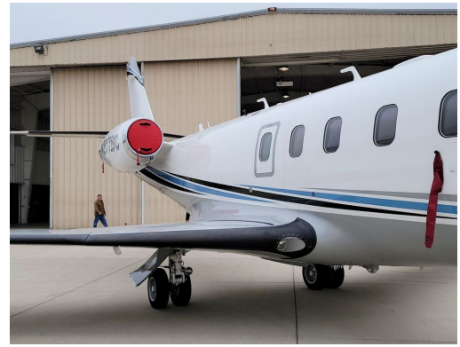
Gulfstream G100 Intake Plugs