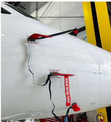
Gulfstream GVII Pitot Probes/TAT/Ice Detector Set, Heat Resistant Type

Gulfstream Aerospace Gulfstream G100 Heat Resistant Pitot Tube Covers are made of Naugahyde vinyl, and lined with a non-burning material. They are designed to cover the entire pitot assembly, slipping over the tube and tightening around the base with a Velcro strap detail. A "Remove Before Flight" streamer is attached to the cover. Heat Resistant Pitot Covers are an upgrade to our standard design, and help prevent the pitot cover from melting onto the tube if the pitot heat is accidentally turned on while installed. If you want the set tethered together, please let us know.