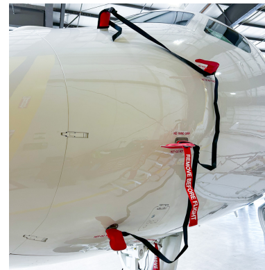
Gulfstream GVII Pitot Probes/TAT/Ice Detector Set, Heat Resistant Type