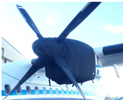
ATR-72-202 Insulated Engine & Prop Hub Covers

This cover type is made from Silver Acrylic Sunbrella canvas and is 100% lined with a soft and smooth microfiber. Bruce's Custom Covers developed this material combination especially for aircraft protection. The outer material is medium weight and treated for water resistance, UV resistance and anti-static buildup. The inner lining is a very soft and smooth microfiber to prevent scratching. The material is very reflective, and tests show that the cabin interior temperature can be reduced to near-ambient temperature on the hottest of days. It is water, ice and snow repellent, yet breathable to allow moisture to escape from between the cover and the aircraft surface.