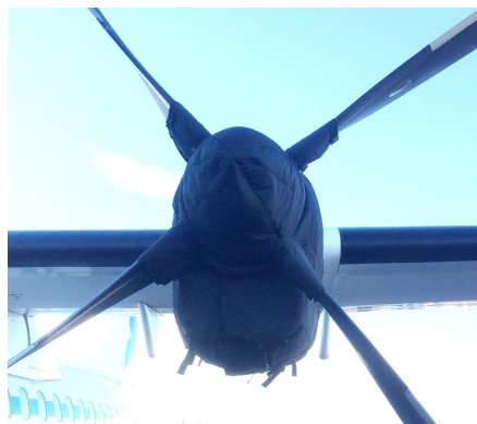
ATR-72-202 Insulated Engine & Prop Hub Covers