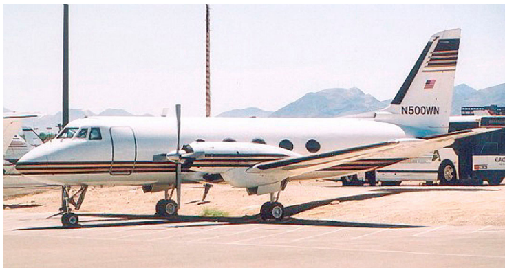
Covers, Plugs, HeatShields and related items for the Grumman Gulfstream I