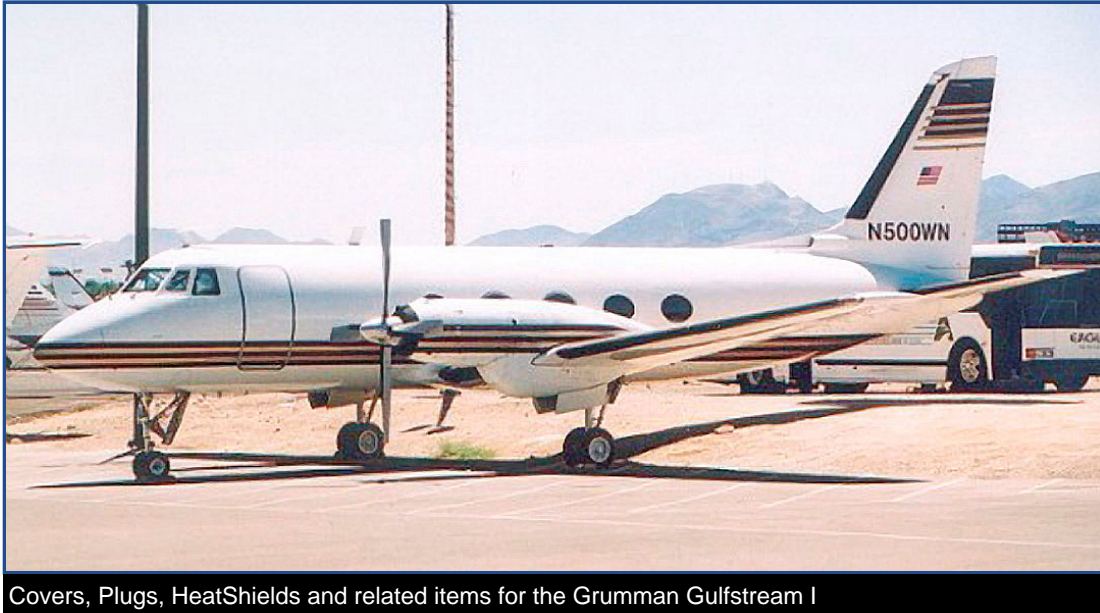
Covers, Plugs, HeatShields and related items for the Grumman Gulfstream I