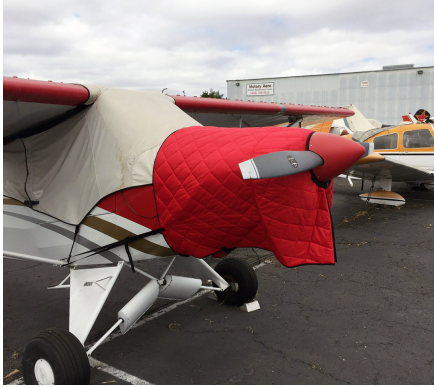
FOR INTERIOR USE. Cub Crafters CC-11 Insulated Hangar Blanket, available in Red or Silver

water resistance, UV resistance and anti-static buildup. The inner lining is a very soft and smooth microfiber to prevent scratching. The material is very reflective, and tests show that the cabin interior temperature can be reduced to near-ambient temperature on the hottest of days. It is water, ice and snow repellent, yet breathable to allow moisture to escape from between the cover and the aircraft surface.