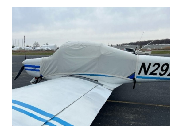
SC Aerostar Festival Canopy Cover

This cover type is made from Silver Acrylic Sunbrella canvas and is 100% lined with a soft and smooth microfiber. Bruce's Custom Covers developed this material combination especially for aircraft protection. The outer material is medium weight and treated for water resistance, UV resistance and anti-static buildup. The inner lining is a very soft and smooth microfiber to prevent scratching. The material is very reflective, and tests show that the cabin interior temperature can be reduced to near-ambient temperature on the hottest of days. It is water, ice and snow repellent, yet breathable to allow moisture to escape from between the cover and the aircraft surface.