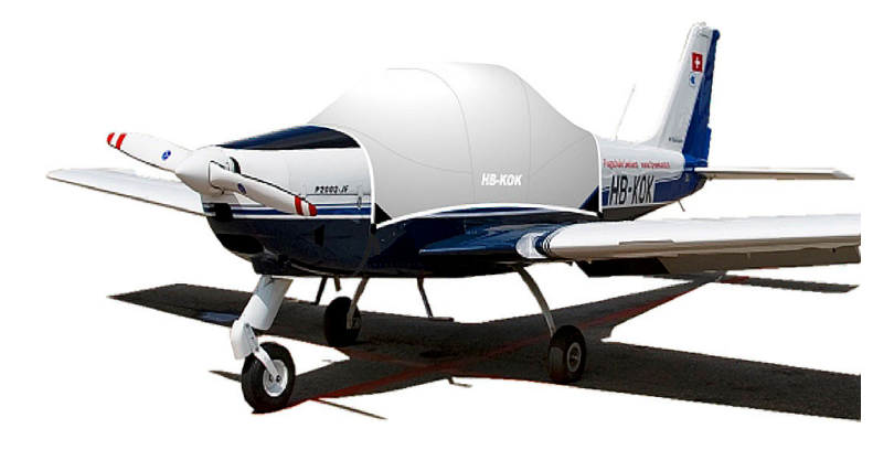
Aerostar Festival Canopy Cover (similar to Tecnam Sierra )