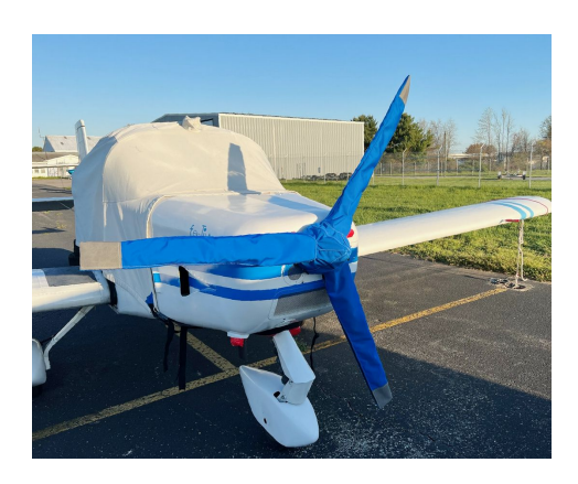
S C Aerostar Festival Prop Cover, Extended Canopy Cover