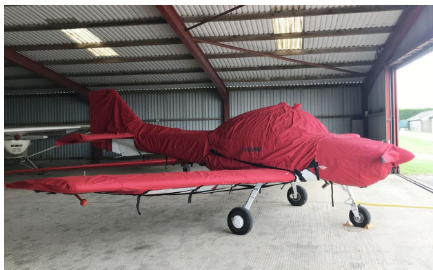
FLS Club Sprint Extended Canopy Cover

Covers developed this material combination especially for aircraft protection. The outer material is medium weight and treated for water resistance, UV resistance and anti-static buildup. The inner lining is a very soft and smooth microfiber to prevent scratching. The material is very reflective, and tests show that the cabin interior temperature can be reduced to near-ambient temperature on the hottest of days. It is water, ice and snow repellent, yet breathable to allow moisture to escape from between the cover and the aircraft surface.