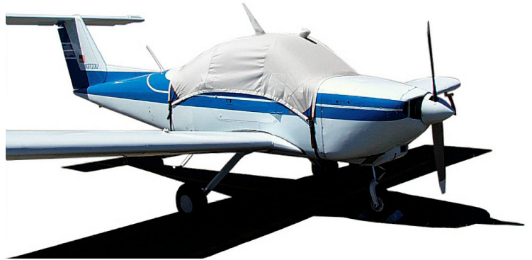
Canopy Cover for Beech Skipper