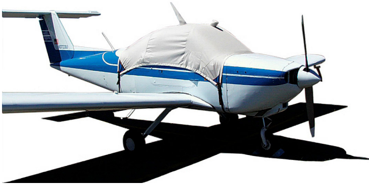
Canopy Cover for Beech Skipper

Covers developed this material combination especially for aircraft protection. The outer material is medium weight and treated for water resistance, UV resistance and anti-static buildup. The inner lining is a very soft and smooth microfiber to prevent scratching. The material is very reflective, and tests show that the cabin interior temperature can be reduced to near-ambient temperature on the hottest of days. It is water, ice and snow repellent, yet breathable to allow moisture to escape from between the cover and the aircraft surface.