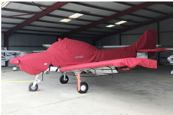
FLS Club Sprint Engine Cover

Engine Covers will cinch around or behind the spinner, cover the entire engine cowl area including the engine air cooling and induction air inlets, and fastens together with Velcro beneath the spinner down the front of the cowling. The Engine Cover is attached with a belly strap aft of the firewall, and can Velcro to the Canopy Cover. Engine Covers are normally made from Solution-Dyed Polyester or Acrylic Sunbrella . An Insulated version of the engine cover can be made with a thicker, quilted, and water-repellent material. The Insulated Engine Cover works well in cold climates to help with engine preheating.