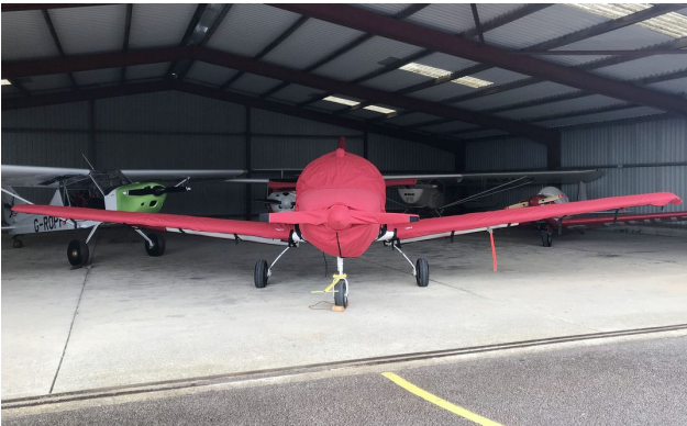
FLS Club Sprint Empennage Cover (Tailboom, Vertical & Horiz Stabilizers) All Year Use

WINTER USE MATERIAL - Made with Solution-Dyed Polyester fabric, this option is intended for seasonal use to aid in deicing, rain mitigation, or for occasional travel. The material is lighter and more compact, but more susceptible to UV damage and may have a shorter useful life if used continuously outside than the all-year use material.