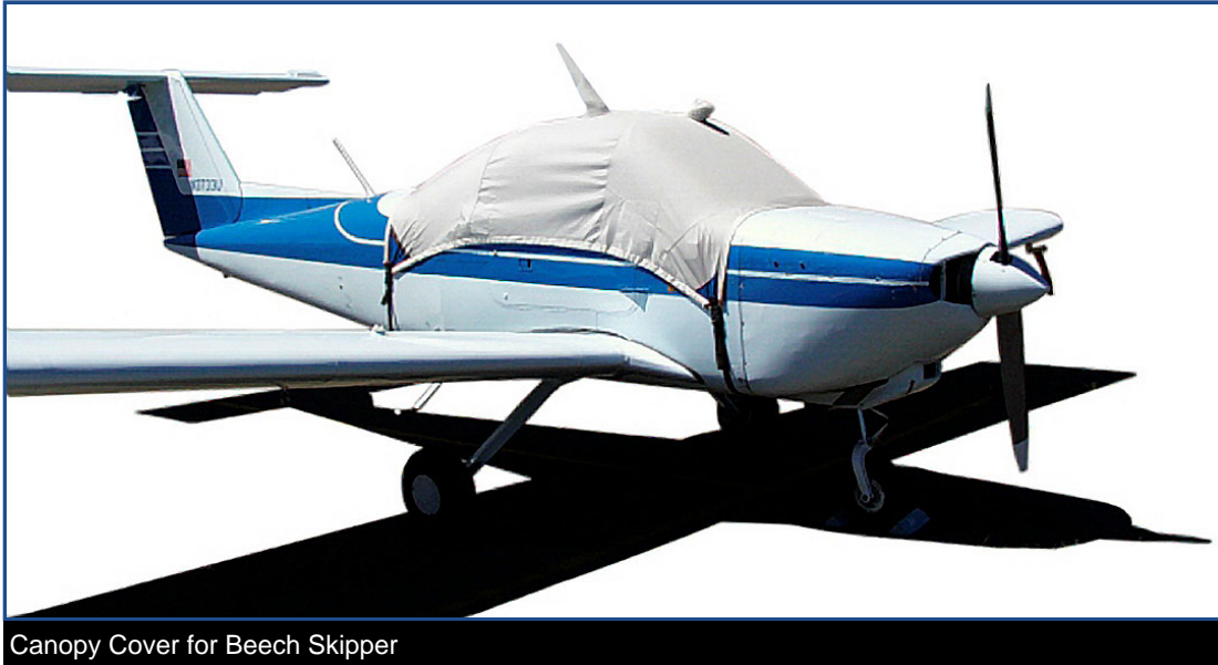
Canopy Cover for Beech Skipper