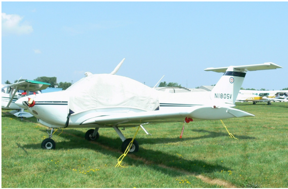
Beech Skipper Canopy Cover, Engine Plugs

Covers developed this material combination especially for aircraft protection. The outer material is medium weight and treated for water resistance, UV resistance and anti-static buildup. The inner lining is a very soft and smooth microfiber to prevent scratching. The material is very reflective, and tests show that the cabin interior temperature can be reduced to near-ambient temperature on the hottest of days. It is water, ice and snow repellent, yet breathable to allow moisture to escape from between the cover and the aircraft surface.