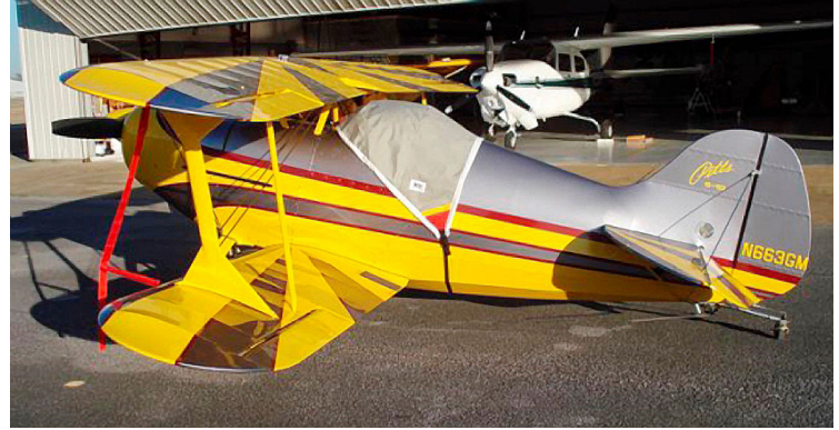
Pitts S1 Canopy Cover