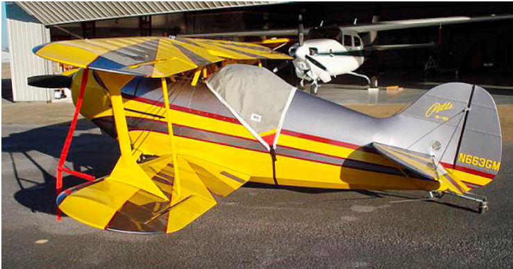
Pitts S1 Canopy Cover

This cover type is made from Silver Acrylic Sunbrella canvas and is 100% lined with a soft and smooth microfiber. Bruce's Custom Covers developed this material combination especially for aircraft protection. The outer material is medium weight and treated for water resistance, UV resistance and anti-static buildup. The inner lining is a very soft and smooth microfiber to prevent scratching. The material is very reflective, and tests show that the cabin interior temperature can be reduced to near-ambient temperature on the hottest of days. It is water, ice and snow repellent, yet breathable to allow moisture to escape from between the cover and the aircraft surface.