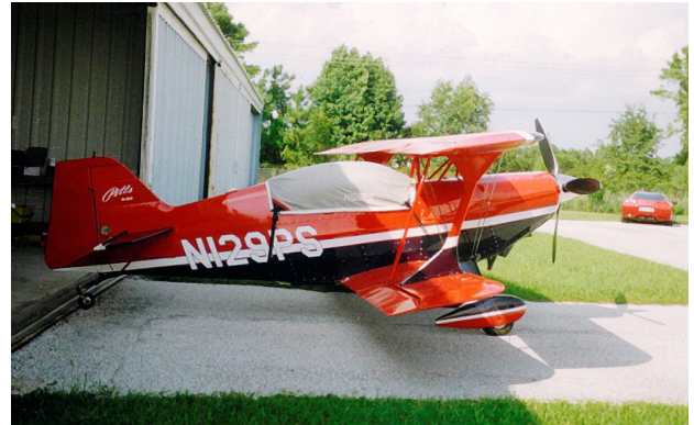
Pitts S2 Canopy Cover