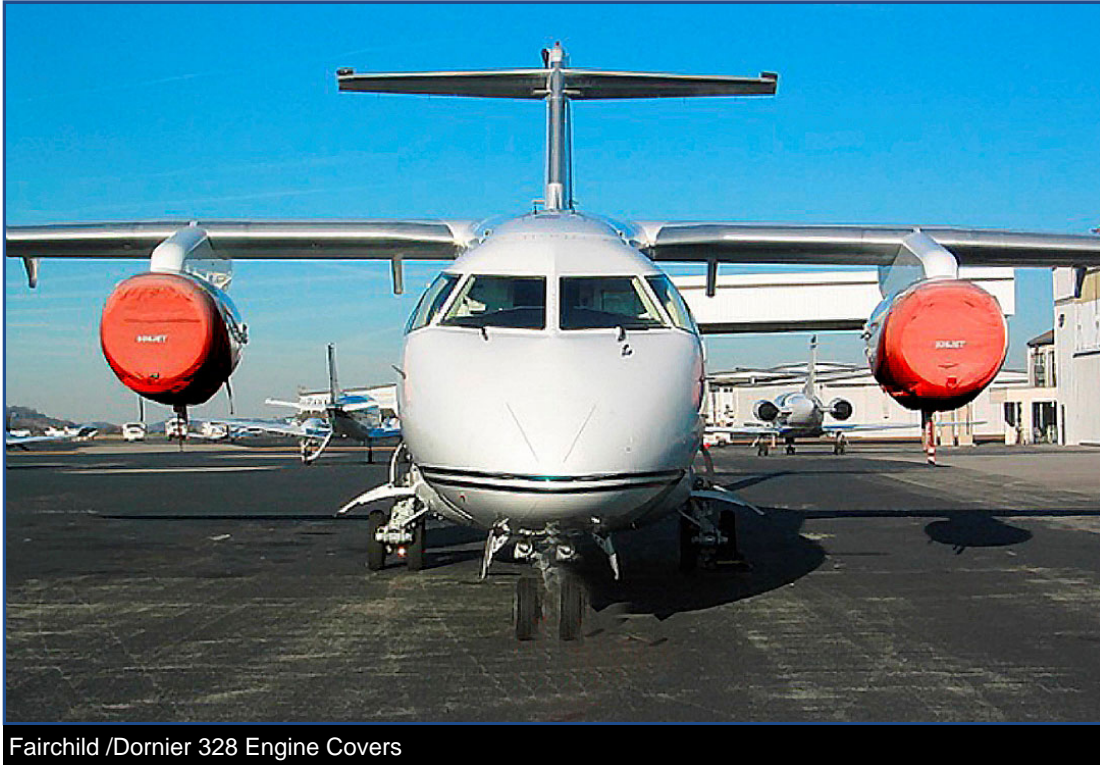
Fairchild /Dornier 328 Engine Covers