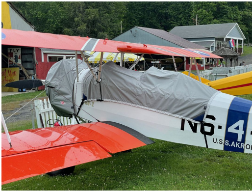
Fleet Biplane Model 1 Canopy & Engine Covers