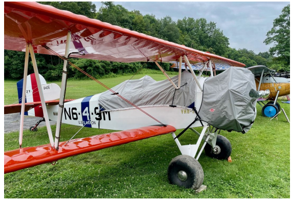
Fleet Biplane Model 1 Canopy & Engine Covers