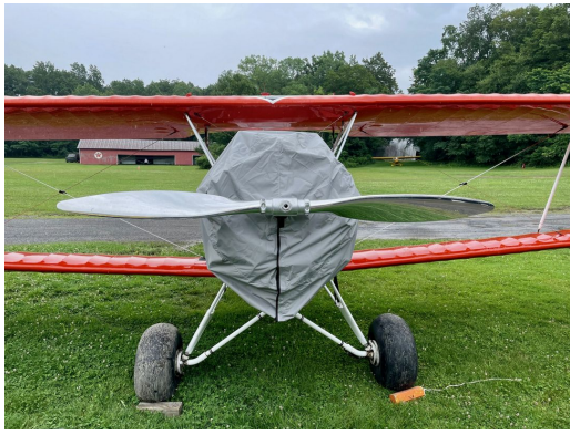
Fleet Biplane Model 1 Canopy & Engine Covers