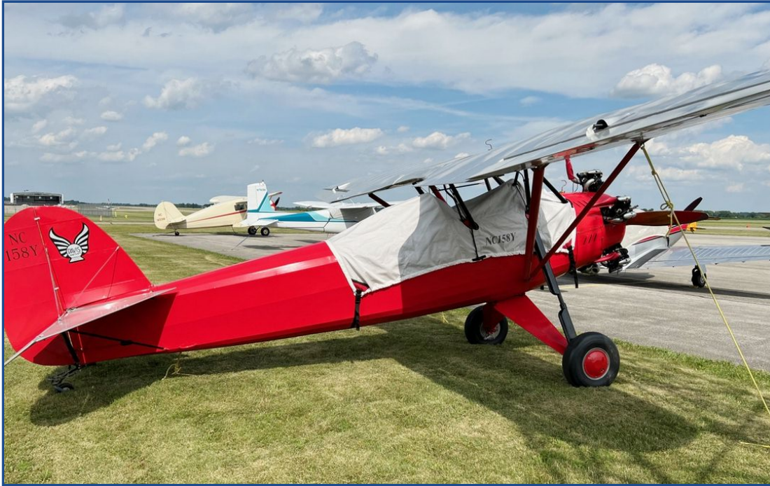
Davis D-1K Canopy Cover