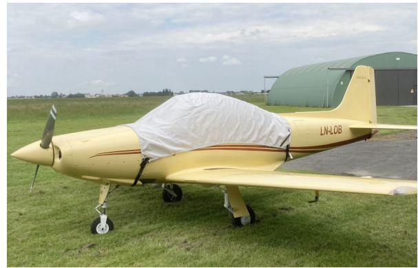
Sequoia Falco Canopy Cover