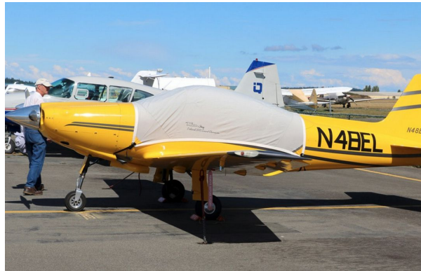
Sequoia Falco Travel Weight Canopy Cover

Travel Covers are made with Silver Solution-Dyed Polyester fabric and only lined over the windshield to save weight. The material is lightweight and more compact for easy stowage in the aircraft. The polyester material is water resistant, but only intended for occasional use outside. We also have an ultra lightweight material available for fitted hangar dust covers. For daily outdoor use, the non-travel Sunbrella Cover is the best choice.