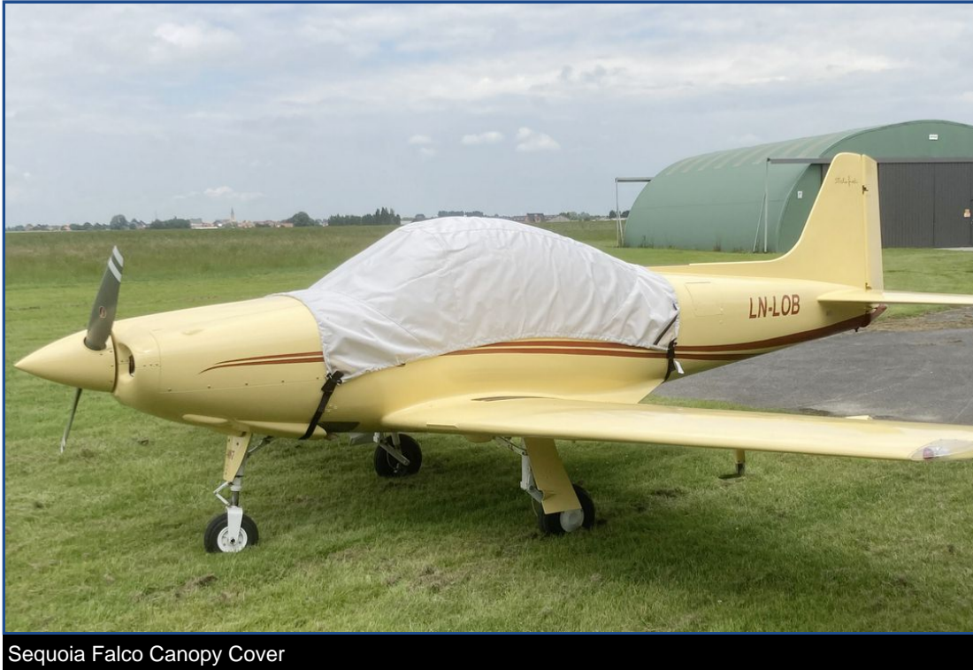
Sequoia Falco Canopy Cover