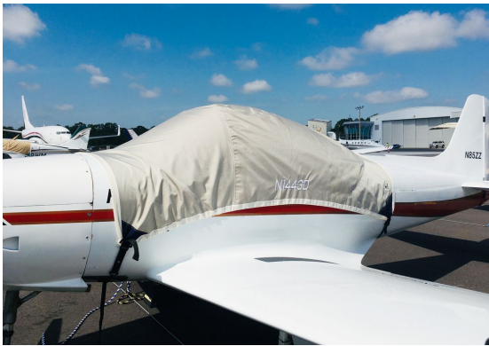
Falco Kit Plane Canopy Cover

This cover type is made from Silver Acrylic Sunbrella canvas and is 100% lined with a soft and smooth microfiber. Bruce's Custom Covers developed this material combination especially for aircraft protection. The outer material is medium weight and treated for water resistance, UV resistance and anti-static buildup. The inner lining is a very soft and smooth microfiber to prevent scratching. The material is very reflective, and tests show that the cabin interior temperature can be reduced to near-ambient temperature on the hottest of days. It is water, ice and snow repellent, yet breathable to allow moisture to escape from between the cover and the aircraft surface.