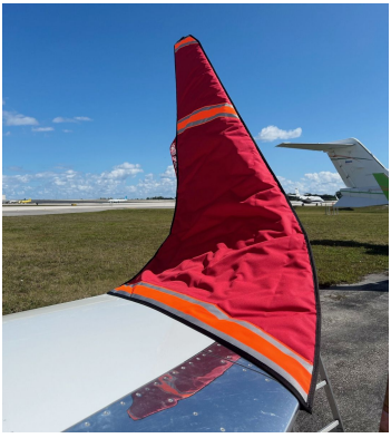
Falcon Jet 900 Winglet Padding Covers