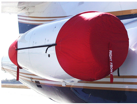
Falcon 50 Outboard Engine Cover