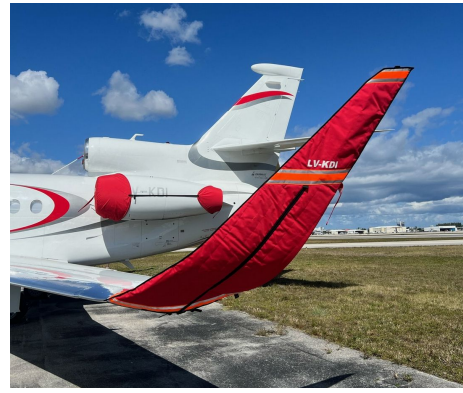
Falcon Jet 900 Winglet Padding Covers