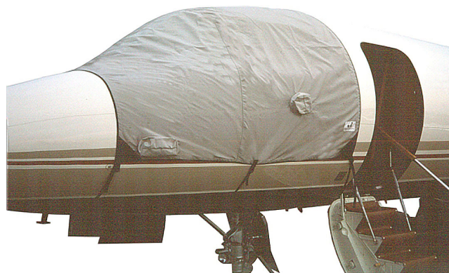
Falcon 50 Windshield Cover

This cover type is made from Silver Acrylic Sunbrella canvas and is 100% lined with a soft and smooth microfiber. Bruce's Custom Covers developed this material combination especially for aircraft protection. The outer material is medium weight and treated for water resistance, UV resistance and anti-static buildup. The inner lining is a very soft and smooth microfiber to prevent scratching. The material is very reflective, and tests show that the cabin interior temperature can be reduced to near-ambient temperature on the hottest of days. It is water, ice and snow repellent, yet breathable to allow moisture to escape from between the cover and the aircraft surface.