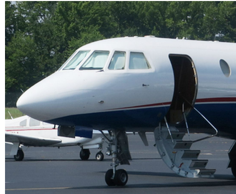
Dassault Falcon 50 Cockpit HeatShields