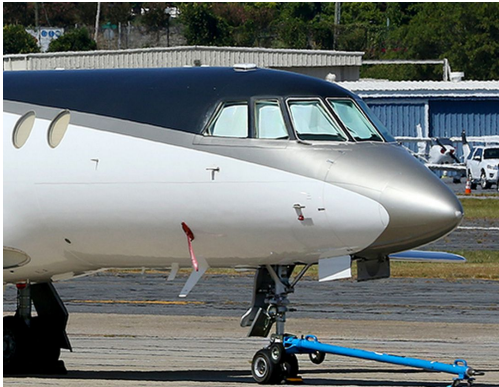
Dassault Falcon 50 Cockpit HeatShields

Cockpit Heatshields are interior sunshades for the aircraft's cockpit. The product is a unique composite of closed-cell foam with a silver mylar finish. The semi-rigid design is stiff enough to stand inside the window framing. The set folds up flat and is easily stored in the included storage sleeve. Some designs may require velcro and suction cups. Our Heatshields for jets are offered white side out because some aircraft manufacturers have issued advisories against reflective window inserts due to potential heat damage. A Heatshield is an excellent short-term remedy for cockpit overheating, but an external fabric cover is more effective for long-term protection.