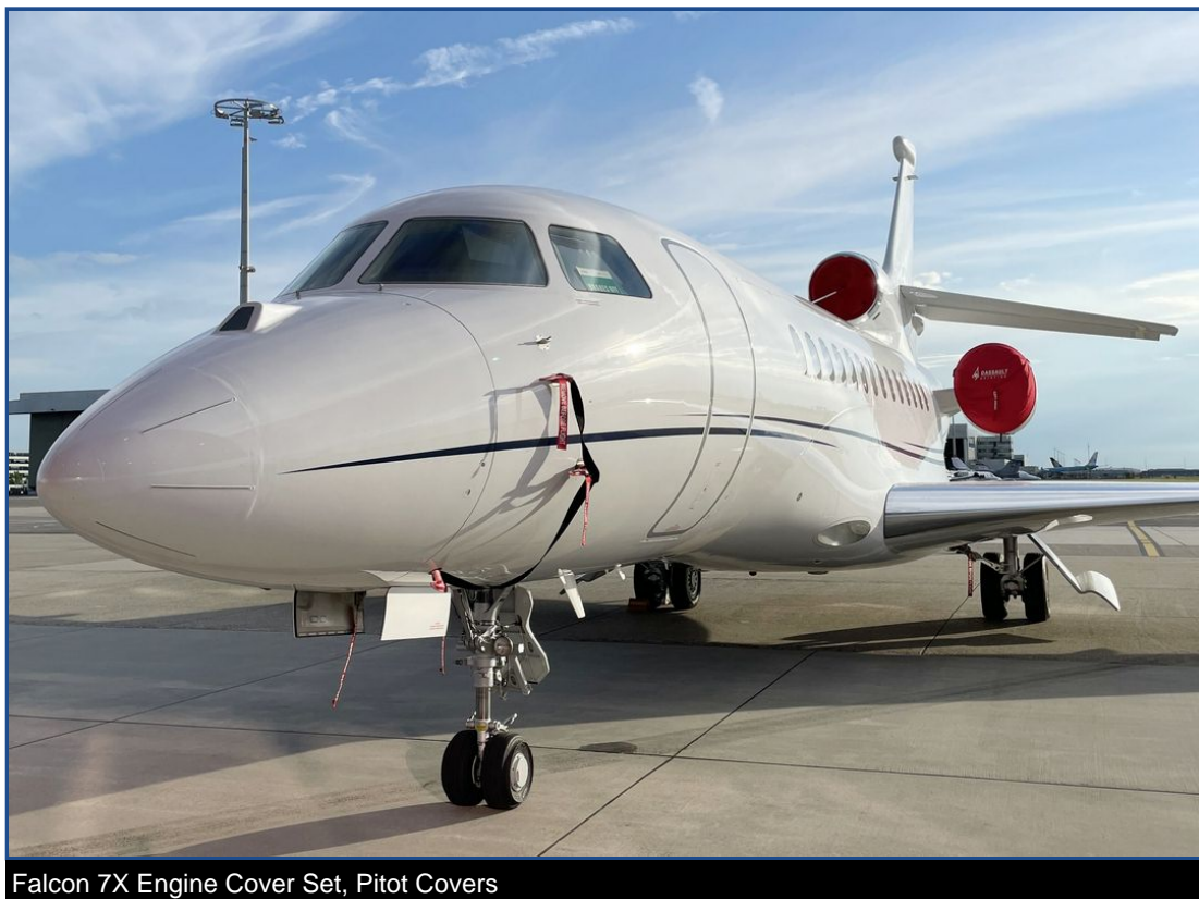
Falcon 7X Engine Cover Set, Pitot Covers