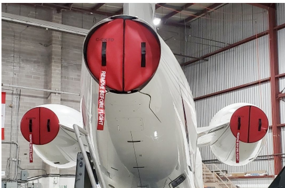
Falcon F7X Exhaust Plugs

The Engine Inlet Plugs are custom fit for your Falcon Jet 7X intakes, made with heavy-duty vinyl material, and stuffed with a single block of sculpted urethane foam. Each plug has a zipper that allows the foam to be removed and dried if necessary. Engine plugs have 'remove before flight' streamers sewn onto the face of the plugs. Most plugs are imprinted with the aircraft registration number in black for an extra charge. Storage bag NOT included. Engine plugs may be inserted after flight when the engine is still warm. Engine Inlet Plugs are commonly referred to as Cowl Plugs, Intake Plugs, Cowl Blocks, Engine Blocks, and Engine Bungs.