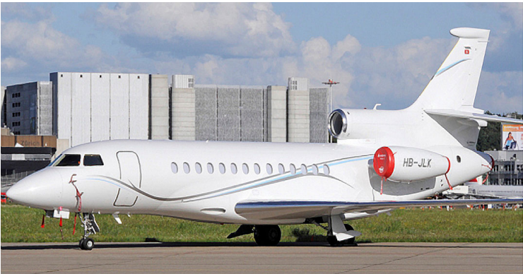
Falcon 7X Engine Covers (Outboard Engines & Center Exhaust)

The Falcon Jet 7X Intake Covers are designed to install easily yet be completely storable. A spring steel hoop is sewn into the hem of each cover, allowing them to be installed without climbing onto the wing or using a stepladder. To store the covers the spring steel hoop folds like a band-saw blade into three nesting rings. Each cover folds into a compact circular bundle which is stored in the included duffle bag, yet they unfold quickly for use. The Tri-Fold Ring cover is made of medium weight nylon which is available in a variety of colors to match the paint trim. Each cover set comes complete with installation and folding instructions. The aircraft's registration number can be silkscreened onto the cover for an extra charge.