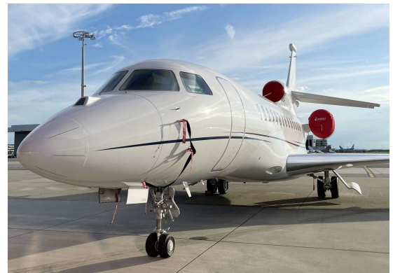
Falcon 7X Engine Cover Set, Pitot Covers