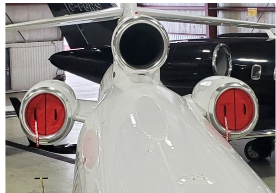
Falcon F7X Outboard Intake Plugs