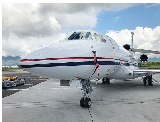
Falcon Jet 7X Pitot Probe/Aoa Set, Heat Resistant Type