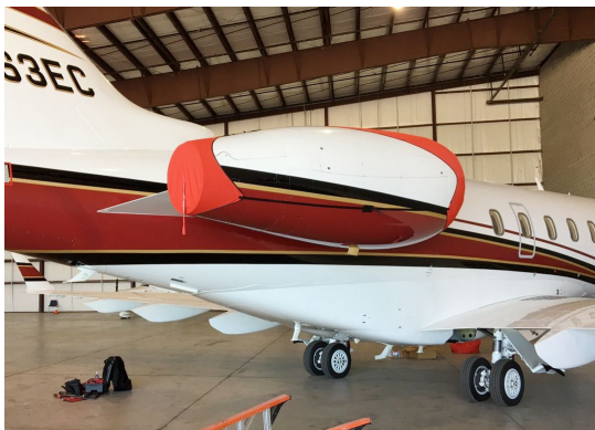
Canadair Challenger 300 Intake/Exhaust Covers, 3-Strap Type

The Falcon Jet 6X Bikini Style Engine Covers are a single-piece design using a soft and smooth stretchy and fabric. The cover stretches tightly over both the intake and exhaust, installing quickly and easily. These covers are designed to be used as hangar dust covers and have a useful life of approximately one year.