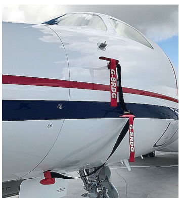
Falcon Jet 7X Pitot Probe/Aoa Set, Heat Resistant Type

The Engine Inlet Plugs are custom fit for your Falcon Jet 6X intakes, made with heavy-duty vinyl material, and stuffed with a single block of sculpted urethane foam. Each plug has a zipper that allows the foam to be removed and dried if necessary. Engine plugs have 'remove before flight' streamers sewn onto the face of the plugs. Most plugs are imprinted with the aircraft registration number in black for an extra charge. Storage bag NOT included. Engine plugs may be inserted after flight when the engine is still warm. Engine Inlet Plugs are commonly referred to as Cowl Plugs, Intake Plugs, Cowl Blocks, Engine Blocks, and Engine Bungs.