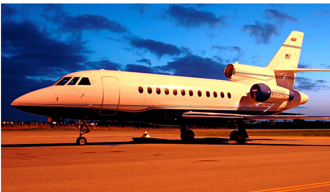
Falcon 900 Engine Covers

The Falcon Jet 50EX Bikini Style Engine Covers are a single-piece design using a soft and smooth stretchy and fabric. The cover stretches tightly over both the intake and exhaust, installing quickly and easily. These covers are designed to be used as hangar dust covers and have a useful life of approximately one year.