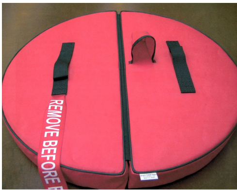
Falcon Center Engine Intake Plug