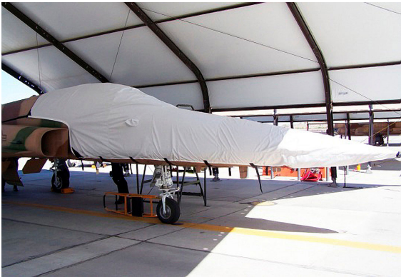
Northup F-5 Talon Canopy/Nose Cover

This cover type is made from Silver Acrylic Sunbrella canvas and is 100% lined with a soft and smooth microfiber. Bruce's Custom Covers developed this material combination especially for aircraft protection. The outer material is medium weight and treated for water resistance, UV resistance and anti-static buildup. The inner lining is a very soft and smooth microfiber to prevent scratching. The material is very reflective, and tests show that the cabin interior temperature can be reduced to near-ambient temperature on the hottest of days. It is water, ice and snow repellent, yet breathable to allow moisture to escape from between the cover and the aircraft surface.