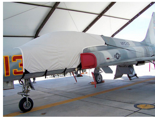
Northrop F5 Talon Canopy Cover