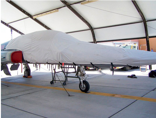
Northrup F5 Talon Canopy Cover

This cover type is made from Silver Acrylic Sunbrella canvas and is 100% lined with a soft and smooth microfiber. Bruce's Custom Covers developed this material combination especially for aircraft protection. The outer material is medium weight and treated for water resistance, UV resistance and anti-static buildup. The inner lining is a very soft and smooth microfiber to prevent scratching. The material is very reflective, and tests show that the cabin interior temperature can be reduced to near-ambient temperature on the hottest of days. It is water, ice and snow repellent, yet breathable to allow moisture to escape from between the cover and the aircraft surface.