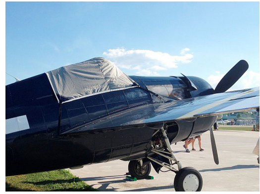
Grumman F4F Wildcat Canopy Cover