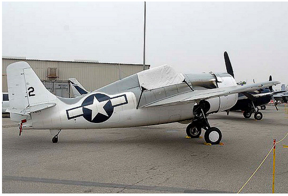
Grumman F4F Wildcat Canopy Cover