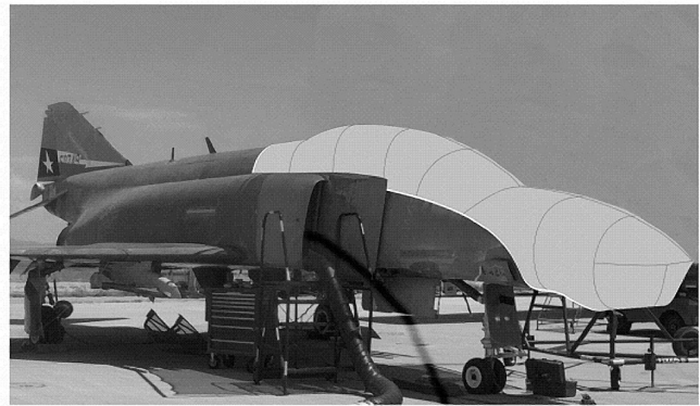
F4 Phantom Canopy/Nose Cover