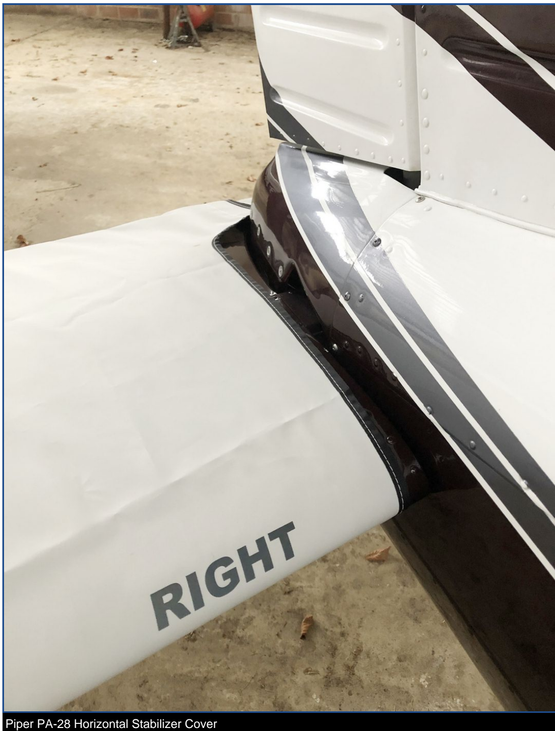
Piper PA-28 Horizontal Stabilizer Cover