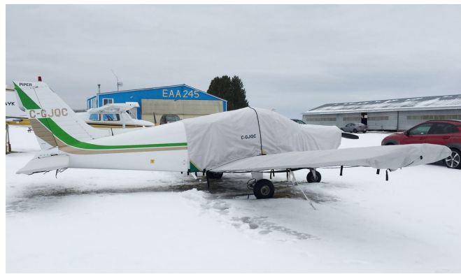
Piper PA-28 Extended Canopy/Engine, Wing & Horizontal Stabilizer Covers