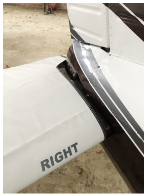
Piper PA-28 Horizontal Stabilizer Cover