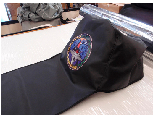
F22 Raptor Ejection Seat Maintenance Cover

The Engine Inlet Plugs are custom fit for your Lockheed Martin/Boeing F-22 Raptor intakes, made with heavy-duty vinyl material, and stuffed with a single block of sculpted urethane foam. Each plug has a zipper that allows the foam to be removed and dried if necessary. Engine plugs have 'remove before flight' streamers sewn onto the face of the plugs. Most plugs are imprinted with the aircraft registration number in black for an extra charge. Storage bag NOT included. Engine plugs may be inserted after flight when the engine is still warm. Engine Inlet Plugs are commonly referred to as Cowl Plugs, Intake Plugs, Cowl Blocks, Engine Blocks, and Engine Bungs.