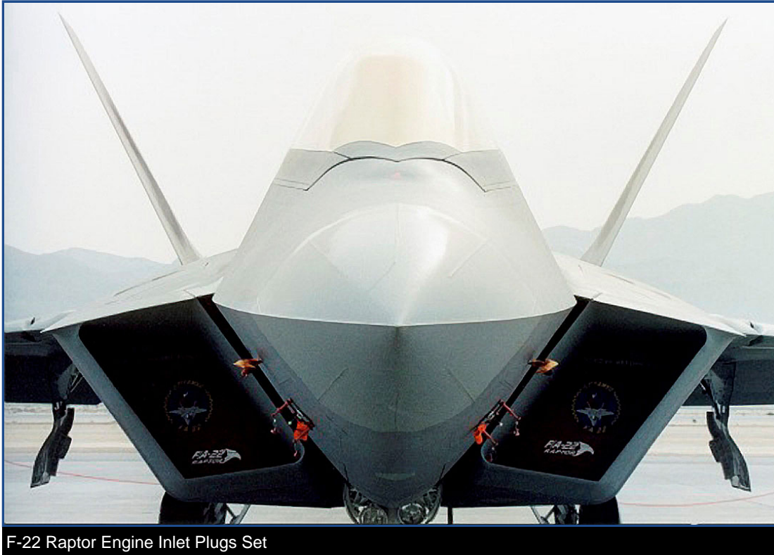
F-22 Raptor Engine Inlet Plugs Set