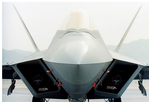
F-22 Raptor Engine Inlet Plugs Set