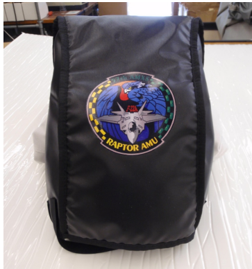
F-22 Raptor HUD Cover, padded