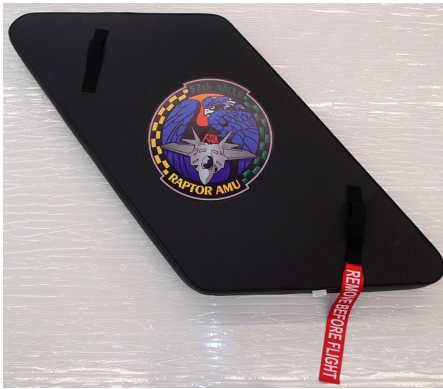
F-22 Raptor Engine Inlet Plug

The Engine Inlet Plugs are custom fit for your Lockheed Martin/Boeing F-22 Raptor intakes, made with heavy-duty vinyl material, and stuffed with a single block of sculpted urethane foam. Each plug has a zipper that allows the foam to be removed and dried if necessary. Engine plugs have 'remove before flight' streamers sewn onto the face of the plugs. Most plugs are imprinted with the aircraft registration number in black for an extra charge. Storage bag NOT included. Engine plugs may be inserted after flight when the engine is still warm. Engine Inlet Plugs are commonly referred to as Cowl Plugs, Intake Plugs, Cowl Blocks, Engine Blocks, and Engine Bungs.