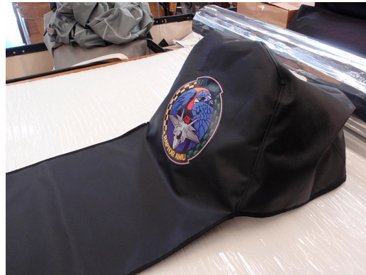
F22 Raptor Ejection Seat Maintenance Cover