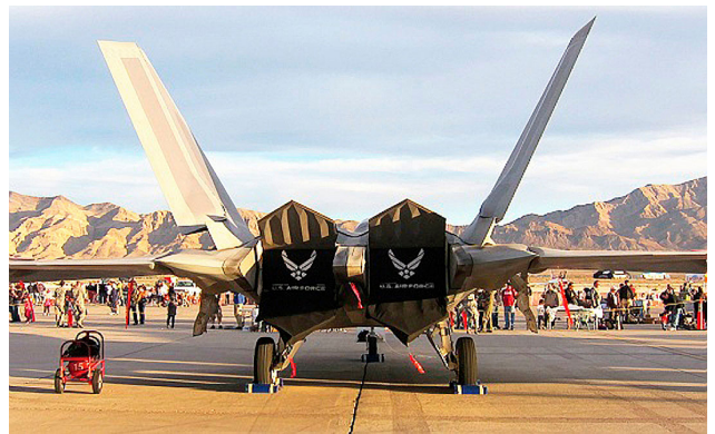
F22 Raptor Exhaust Plugs