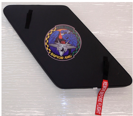
F-22 Raptor Engine Inlet Plug

The Engine Inlet Plugs are custom fit for your Lockheed Martin/Boeing F-22 Raptor intakes, made with heavy-duty vinyl material, and stuffed with a single block of sculpted urethane foam. Each plug has a zipper that allows the foam to be removed and dried if necessary. Engine plugs have 'remove before flight' streamers sewn onto the face of the plugs. Most plugs are imprinted with the aircraft registration number in black for an extra charge. Storage bag NOT included. Engine plugs may be inserted after flight when the engine is still warm. Engine Inlet Plugs are commonly referred to as Cowl Plugs, Intake Plugs, Cowl Blocks, Engine Blocks, and Engine Bungs.