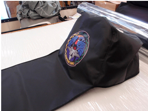
F22 Raptor Ejection Seat Maintenance Cover