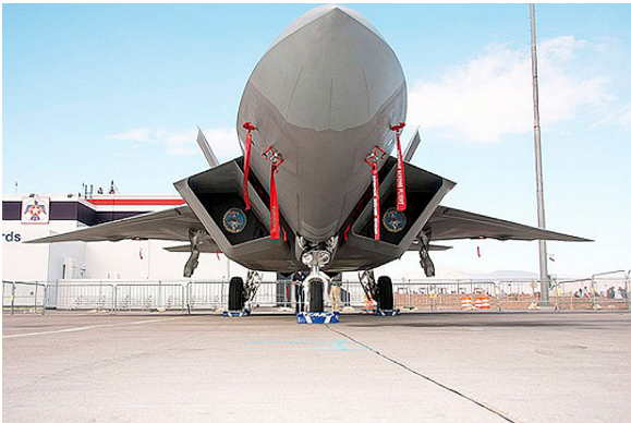
F-22 Raptor Engine Inlet Plugs Set

The Engine Inlet Plugs are custom fit for your Lockheed Martin/Boeing F-22 Raptor intakes, made with heavy-duty vinyl material, and stuffed with a single block of sculpted urethane foam. Each plug has a zipper that allows the foam to be removed and dried if necessary. Engine plugs have 'remove before flight' streamers sewn onto the face of the plugs. Most plugs are imprinted with the aircraft registration number in black for an extra charge. Storage bag NOT included. Engine plugs may be inserted after flight when the engine is still warm. Engine Inlet Plugs are commonly referred to as Cowl Plugs, Intake Plugs, Cowl Blocks, Engine Blocks, and Engine Bungs.