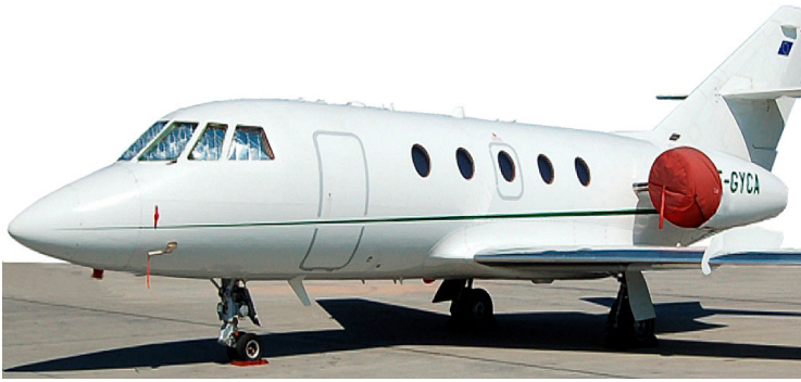
Falcon Engine Cover & Cockpit HeatShields