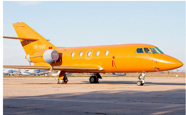
Falcon Engine Covers