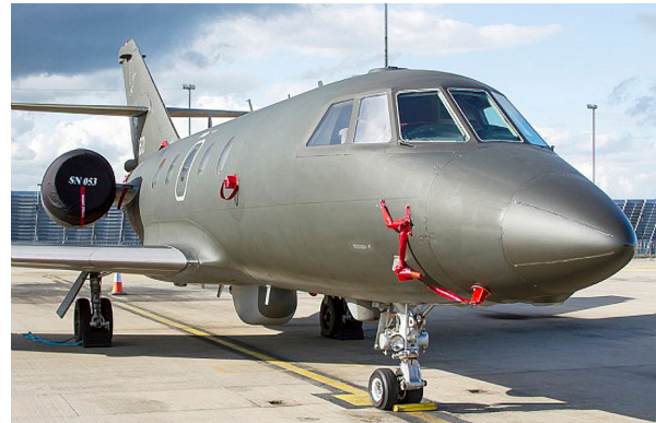
Falcon Engine Covers (not our probe covers)