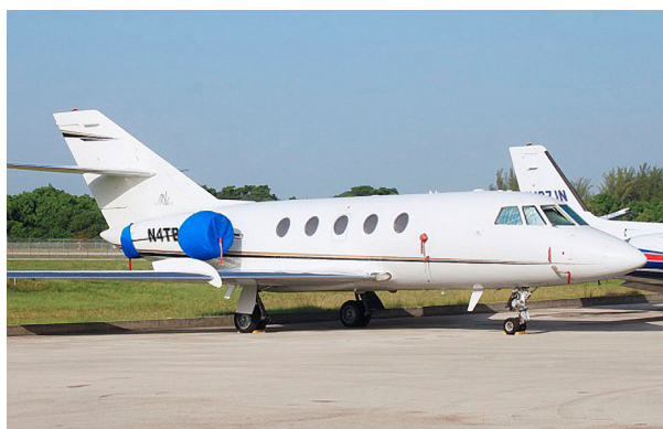
Falcon Engine Cover & Cockpit HeatShields

The Falcon Jet 20 (HU-25) Bikini Style Engine Covers are a single-piece design using a soft and smooth stretchy and fabric. The cover stretches tightly over both the intake and exhaust, installing quickly and easily. These covers are designed to be used as hangar dust covers and have a useful life of approximately one year.