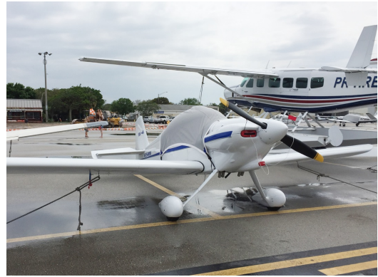
Van's RV-4/Harmon Rocket Travel Cover