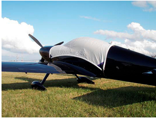
Harmon Rocket Canopy Cover

Travel Covers are made with Silver Solution-Dyed Polyester fabric and only lined over the windshield to save weight. The material is lightweight and more compact for easy stowage in the aircraft. The polyester material is water resistant, but only intended for occasional use outside. We also have an ultra lightweight material available for fitted hangar dust covers. For daily outdoor use, the non-travel Sunbrella Cover is the best choice.