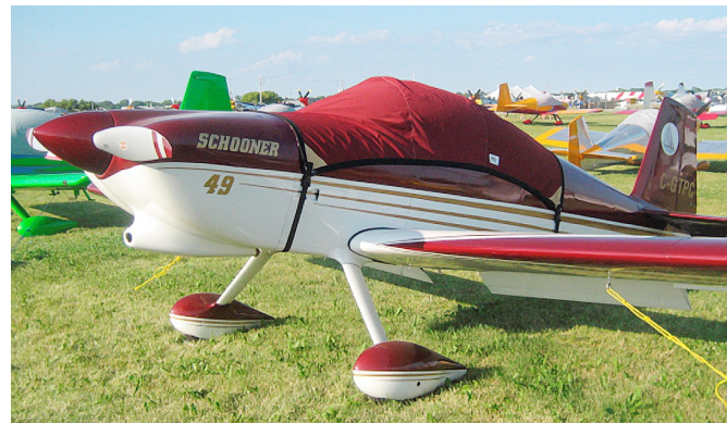
F1 Rocket Canopy Cover