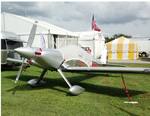
F1 Rocket Canopy Cover, Engine Plugs

This cover type is made from Silver Acrylic Sunbrella canvas and is 100% lined with a soft and smooth microfiber. Bruce's Custom Covers developed this material combination especially for aircraft protection. The outer material is medium weight and treated for water resistance, UV resistance and anti-static buildup. The inner lining is a very soft and smooth microfiber to prevent scratching. The material is very reflective, and tests show that the cabin interior temperature can be reduced to near-ambient temperature on the hottest of days. It is water, ice and snow repellent, yet breathable to allow moisture to escape from between the cover and the aircraft surface.