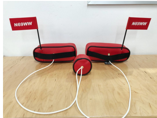
F1 Rocket Engine Plugs too small to imprint on plugs