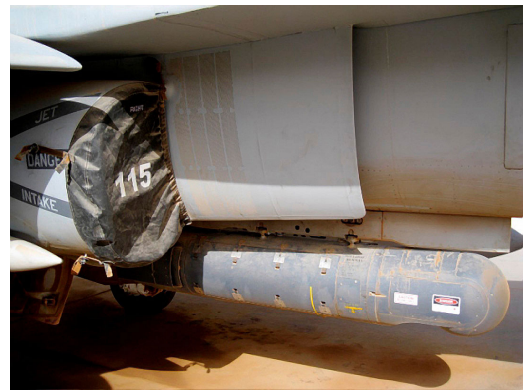
F-18 Intake Covers