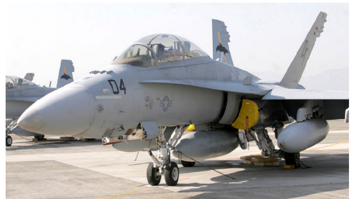
F-18 Intake Cover Set