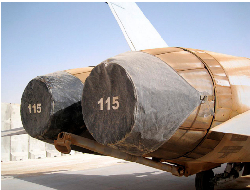
F-18 Exhaust Covers

The McDonnell Douglas F-18 Hornet, Super Hornet Intake Covers are designed to install easily yet be completely storable. A spring steel hoop is sewn into the hem of each cover, allowing them to be installed without climbing onto the wing or using a step ladder. To store the covers the spring steel hoop folds like a band-saw blade into three nesting rings. Each cover folds into a compact circular bundle which is stored in the included duffle bag, yet they unfold quickly for use. The Tri-Fold Ring cover is made of medium weight nylon which is available in a variety of colors to match the paint trim. Each cover set comes complete with installation and folding instructions. The aircraft's registration number can be silkscreened onto the cover for an extra charge.