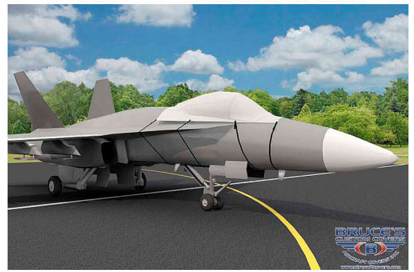
F-18 Canopy Cover, illustration