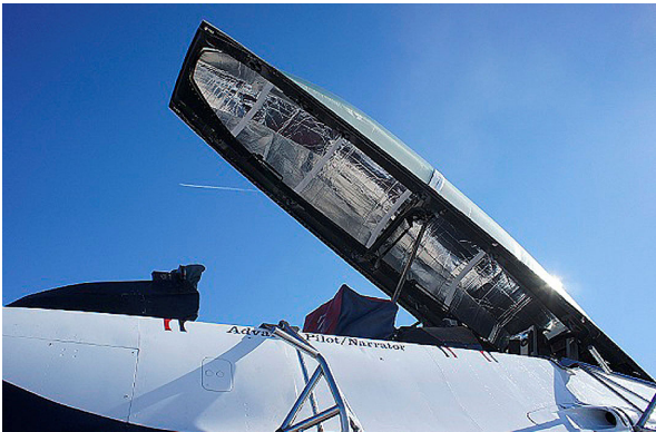
F-16 Cockpit HeatShields

Cockpit Heatshields are interior sunshades for the aircraft's cockpit. The product is a unique composite of closed-cell foam with a silver mylar finish. The semi-rigid design is stiff enough to stand inside the window framing. The set folds up flat and is easily stored in the included storage sleeve. Some designs may require velcro and suction cups. Our Heatshields for jets are offered white side out because some aircraft manufacturers have issued advisories against reflective window inserts due to potential heat damage. A Heatshield is an excellent short-term remedy for cockpit overheating, but an external fabric cover is more effective for long-term protection.