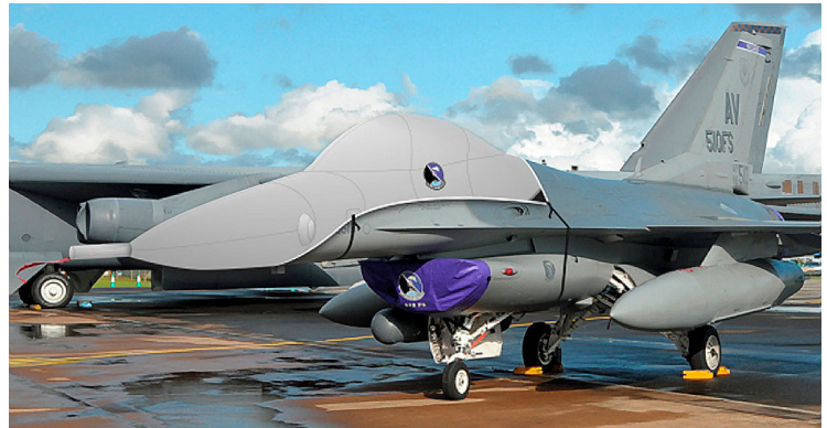
F-16 Canopy/Nose Cover