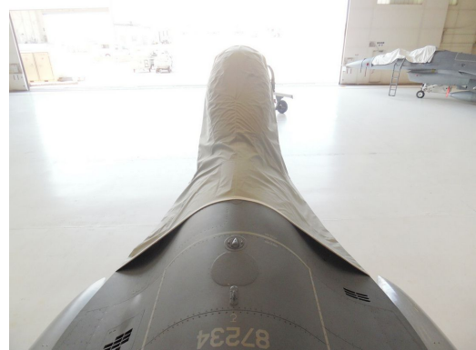
F-16 CANOPY COVER, OPEN POSITION (C-Model, single seat models) F-16 CANOPY COVER, OPEN POSITION (C-Model, single seat models)