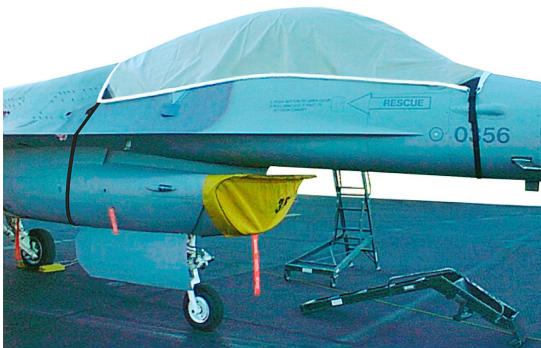
Canopy Cover, F-16

Travel Covers are made with Silver Solution-Dyed Polyester fabric and only lined over the windshield to save weight. The material is lightweight and more compact for easy stowage in the aircraft. The polyester material is water resistant, but only intended for occasional use outside. We also have an ultra lightweight material available for fitted hangar dust covers. For daily outdoor use, the non-travel Sunbrella Cover is the best choice.