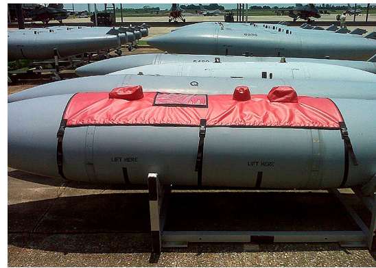
370 gal. WING FUEL TANK PYLON COVER, with/without forms pouch