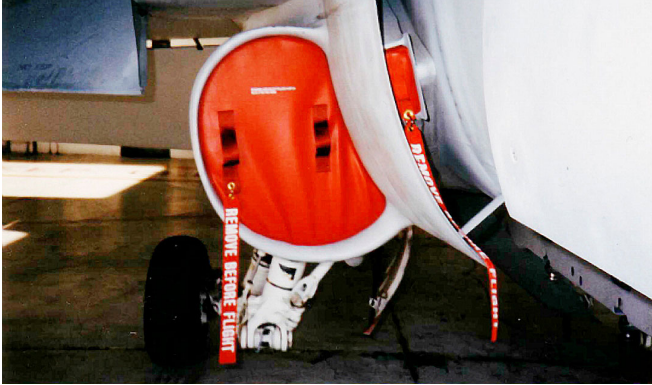
Engine & ECS Inlet Plugs

The General Dynamics F-16 Fighting Falcon Intake Covers are designed to install easily yet be completely storable. A spring steel hoop is sewn into the hem of each cover, allowing them to be installed without climbing onto the wing or using a stepladder. To store the covers the spring steel hoop folds like a band-saw blade into three nesting rings. Each cover folds into a compact circular bundle which is stored in the included duffle bag, yet they unfold quickly for use. The Tri-Fold Ring cover is made of medium weight nylon which is available in a variety of colors to match the paint trim. Each cover set comes complete with installation and folding instructions. The aircraft's registration number can be silkscreened onto the cover for an extra charge.