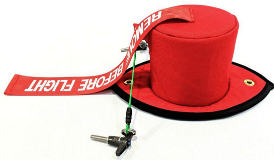
General Dynamics F-16 AOA Probe Cover

The Engine Inlet Plugs are custom fit for your General Dynamics F-16 Fighting Falcon intakes, made with heavy-duty vinyl material, and stuffed with a single block of sculpted urethane foam. Each plug has a zipper that allows the foam to be removed and dried if necessary. Engine plugs have 'remove before flight' streamers sewn onto the face of the plugs. Most plugs are imprinted with the aircraft registration number in black for an extra charge. Storage bag NOT included. Engine plugs may be inserted after flight when the engine is still warm. Engine Inlet Plugs are commonly referred to as Cowl Plugs, Intake Plugs, Cowl Blocks, Engine Blocks, and Engine Bungs.