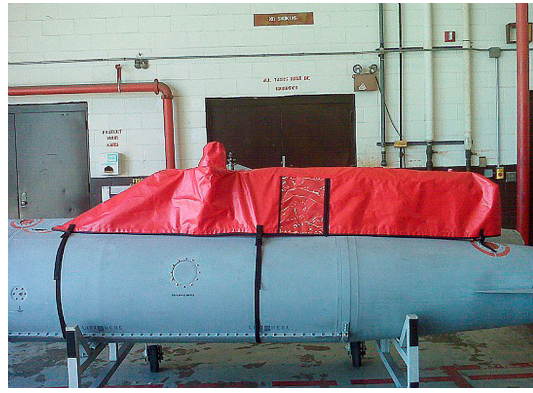
370 gal. WING FUEL TANK PYLON COVER, with/without forms pouch