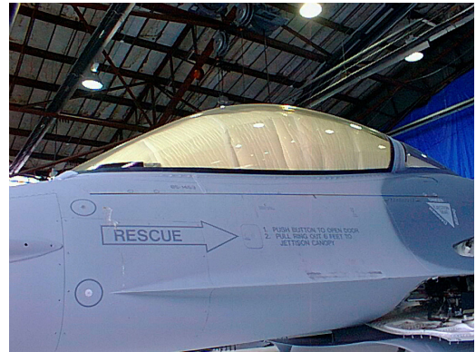
General Dynamics F-16 Cockpit HeatShields