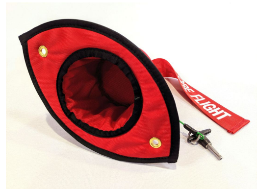
General Dynamics F-16 AOA Probe Cover