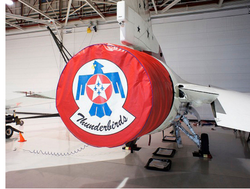
F-16 Radome, Pitot, Air Data Probe Cover, Intake Cover, HUD Cover, Seat Cover