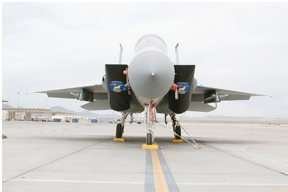
McDonnell-Douglas F-15 Intake Covers

The McDonnell Douglas F-15 Eagle Intake Covers are designed to install easily yet be completely storable. A spring steel hoop is sewn into the hem of each cover, allowing them to be installed without climbing onto the wing or using a stepladder. To store the covers the spring steel hoop folds like a band-saw blade into three nesting rings. Each cover folds into a compact circular bundle which is stored in the included duffle bag, yet they unfold quickly for use. The Tri-Fold Ring cover is made of medium weight nylon which is available in a variety of colors to match the paint trim. Each cover set comes complete with installation and folding instructions. The aircraft's registration number can be silkscreened onto the cover for an extra charge.