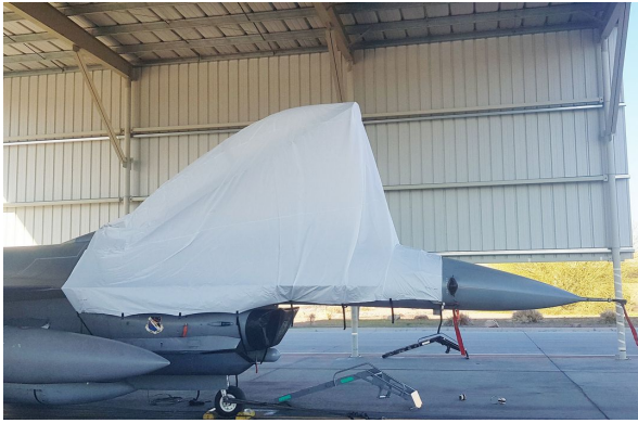
McDonnell Douglas F16-D Canopy Cover, open cockpit type (test fit cover)

Canopy Covers are commonly referred to as Cabin Covers, Fuselage Covers, Canvas Covers, Canopy Caps, etc.