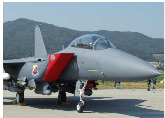
McDonnell Douglas F-15 Eagle Engine Inlet Covers