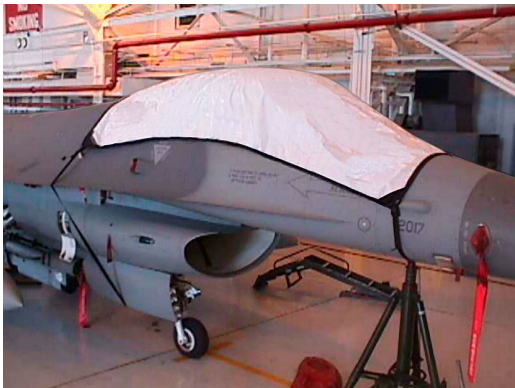
F-16 "Blackout" type Canopy Cover