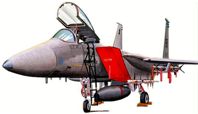
F15 Cockpit HeatShields & Inlet Cover