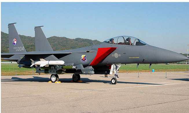
Intake Cover, F15-K

The McDonnell Douglas F-15 Eagle Intake Covers are designed to install easily yet be completely storable. A spring steel hoop is sewn into the hem of each cover, allowing them to be installed without climbing onto the wing or using a stepladder. To store the covers the spring steel hoop folds like a band-saw blade into three nesting rings. Each cover folds into a compact circular bundle which is stored in the included duffle bag, yet they unfold quickly for use. The Tri-Fold Ring cover is made of medium weight nylon which is available in a variety of colors to match the paint trim. Each cover set comes complete with installation and folding instructions. The aircraft's registration number can be silkscreened onto the cover for an extra charge.