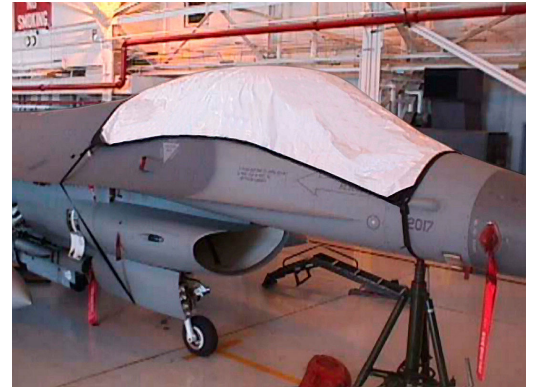
F-16 "Blackout" type Canopy Cover