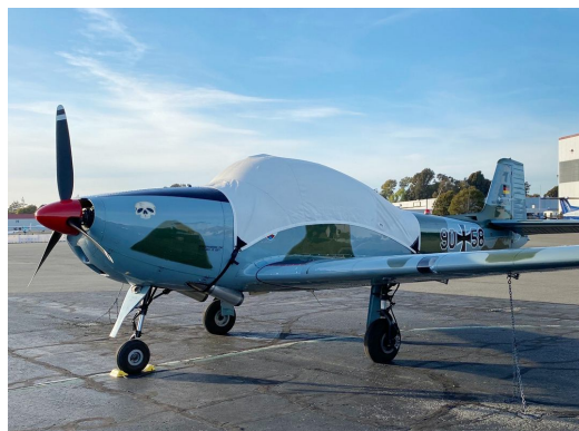
Focke Wulf 149 Trainer Canopy Cover