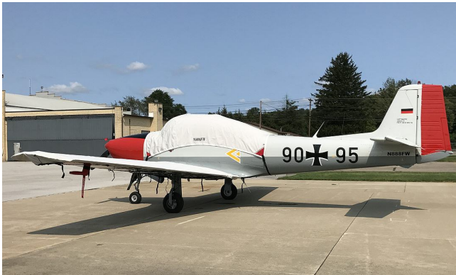
Focke Wulf F149 Canopy Cover, Wing Covers