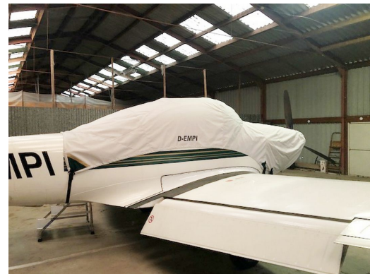
Piaggio FW-149D Canopy/Engine Cover