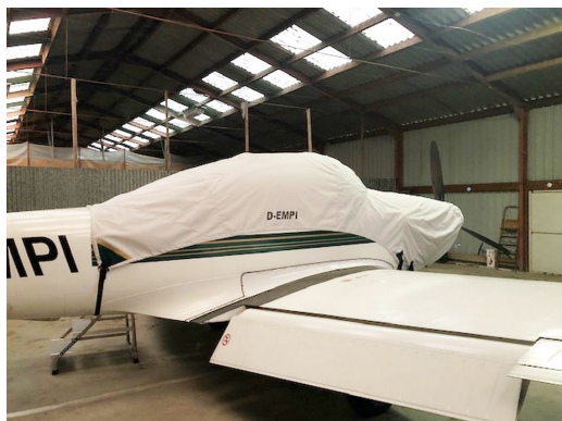
Piaggio FW-149D Canopy/Engine Cover

of the Canopy Cover and Engine Cover. This cover will enclose the engine cowl and will extend aft to cover all of the windows. This cover type is made from Silver Acrylic Sunbrella canvas and is 100% lined with a soft and smooth microfiber. Bruce's Custom Covers developed this material combination especially for aircraft protection. The outer material is medium weight and treated for water resistance, UV resistance and anti-static buildup. The inner lining is a very soft and smooth microfiber to prevent scratching. The material is very reflective, and tests show that the cabin interior temperature can be reduced to near-ambient temperature on the hottest of days. It is water, ice and snow repellent, yet breathable to allow moisture to escape from between the cover and the aircraft surface.