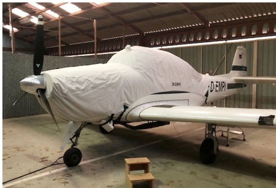
Piaggio FW-149D Canopy/Engine Cover

of the Canopy Cover and Engine Cover. This cover will enclose the engine cowl and will extend aft to cover all of the windows. This cover type is made from Silver Acrylic Sunbrella canvas and is 100% lined with a soft and smooth microfiber. Bruce's Custom Covers developed this material combination especially for aircraft protection. The outer material is medium weight and treated for water resistance, UV resistance and anti-static buildup. The inner lining is a very soft and smooth microfiber to prevent scratching. The material is very reflective, and tests show that the cabin interior temperature can be reduced to near-ambient temperature on the hottest of days. It is water, ice and snow repellent, yet breathable to allow moisture to escape from between the cover and the aircraft surface.