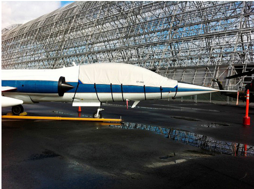
F-104 Tandem Canopy Cover