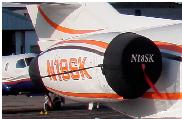
Falcon Jet Engine Intake/Exhaust Cover Set