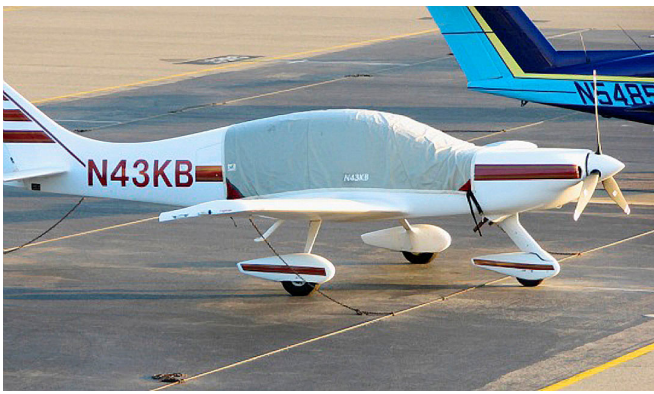
Wheeler Express Canopy Cover