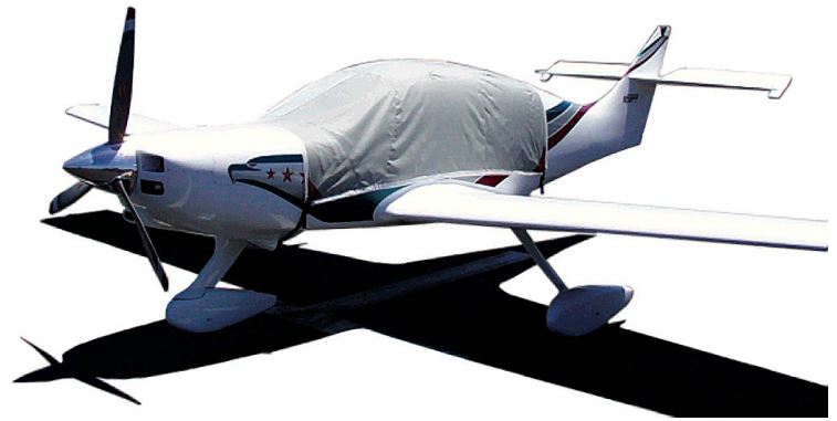
Wheeler Express Canopy Cover