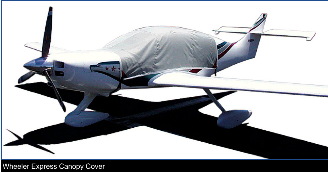
Wheeler Express Canopy Cover