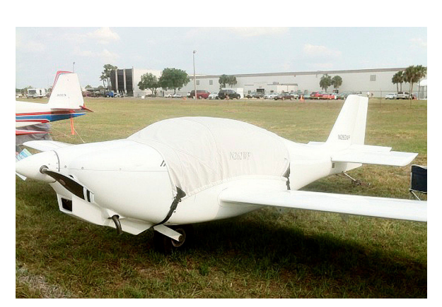
Europa XS Canopy Cover