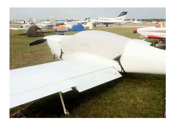
Europa XS Canopy Cover