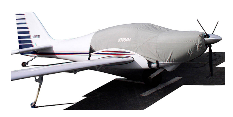
Europa Canopy/Engine Cover

The Europa All Europa Models Canopy/Engine Cover is a one-piece cover (100% lined with microfiber) that is a combination of the Canopy Cover and Engine Cover. This cover will enclose the engine cowl and will extend aft to cover all of the windows. This cover type is made from Silver Acrylic Sunbrella canvas and is 100% lined with a soft and smooth microfiber. Bruce's Custom Covers developed this material combination especially for aircraft protection. The outer material is medium weight and treated for water resistance, UV resistance and anti-static buildup. The inner lining is a very soft and smooth microfiber to prevent scratching. The material is very reflective, and tests show that the cabin interior temperature can be reduced to near-ambient temperature on the hottest of days. It is water, ice and snow repellent, yet breathable to allow moisture to escape from between the cover and the aircraft surface.