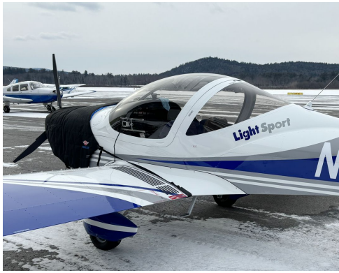
Evektor Harmony Insulated Engine Cover