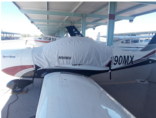
Evektor Sportstar Max Canopy Cover

This cover type is made from Silver Acrylic Sunbrella canvas and is 100% lined with a soft and smooth microfiber. Bruce's Custom Covers developed this material combination especially for aircraft protection. The outer material is medium weight and treated for water resistance, UV resistance and anti-static buildup. The inner lining is a very soft and smooth microfiber to prevent scratching. The material is very reflective, and tests show that the cabin interior temperature can be reduced to near-ambient temperature on the hottest of days. It is water, ice and snow repellent, yet breathable to allow moisture to escape from between the cover and the aircraft surface.