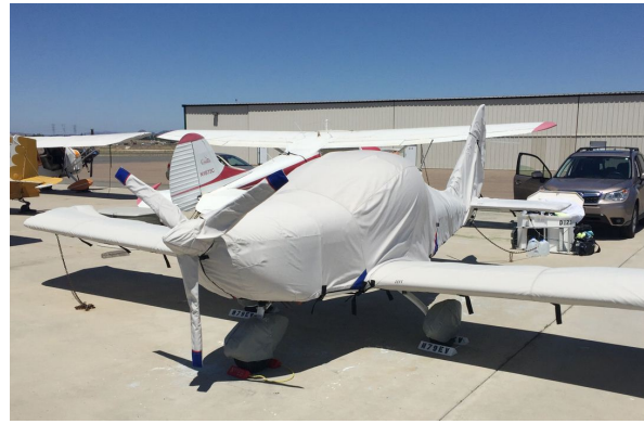
2017 Evektor Sportstar Max All Year Use Wing Covers