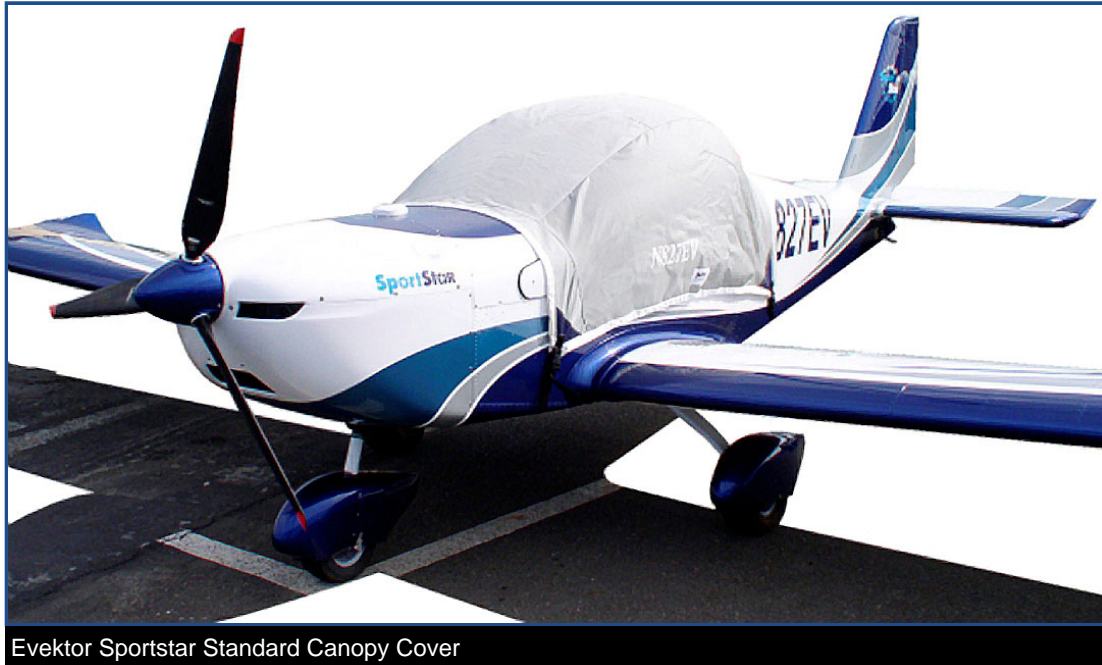
Evektor Sportstar Standard Canopy Cover