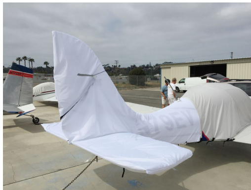
2017 Evector Sportstar Max Extended Canopy/Engine Cover Evekotor SportStar, Eurostar, Max Empennage Cover, test fit cover.