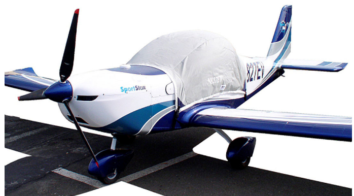
Evektor Sportstar Standard Canopy Cover