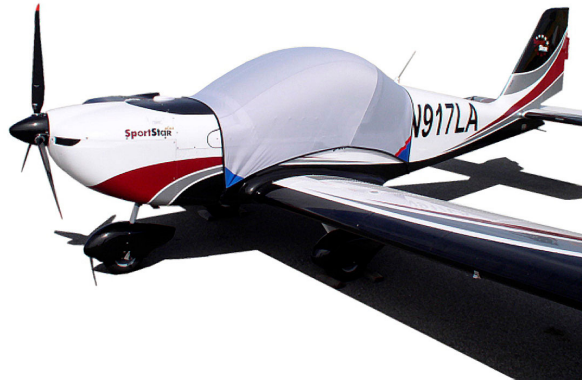
Evektor Sportstar Light Weight Travel-Cover