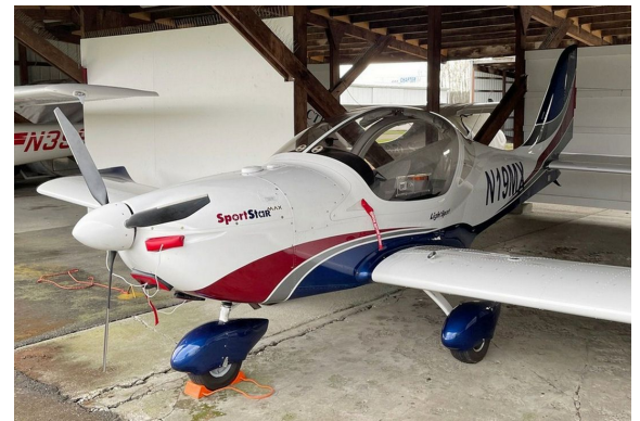
Evektor SportStar Engine & Vent Plugs