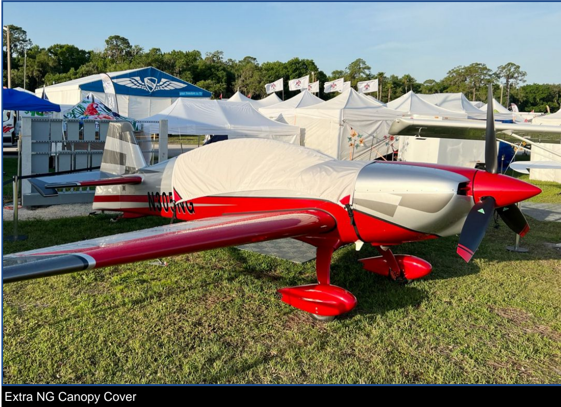
Extra NG Canopy Cover