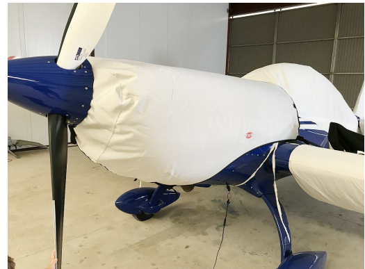
Extra 300, 330SC & 200/230 Models Engine Cover