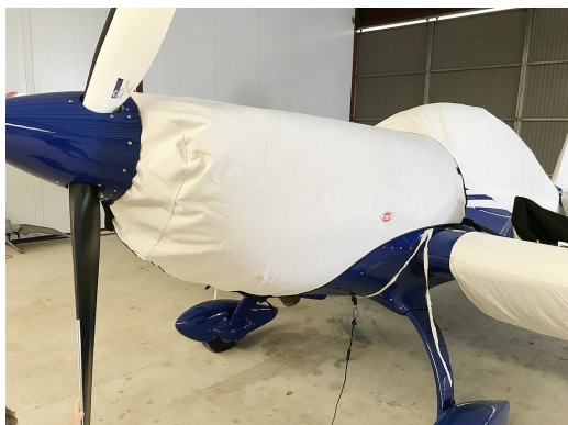
Extra 300, 330SC & 200/230 Models Engine Cover

This cover type is made from Silver Acrylic Sunbrella canvas and is 100% lined with a soft and smooth microfiber. Bruce's Custom Covers developed this material combination especially for aircraft protection. The outer material is medium weight and treated for water resistance, UV resistance and anti-static buildup. The inner lining is a very soft and smooth microfiber to prevent scratching. The material is very reflective, and tests show that the cabin interior temperature can be reduced to near-ambient temperature on the hottest of days. It is water, ice and snow repellent, yet breathable to allow moisture to escape from between the cover and the aircraft surface.