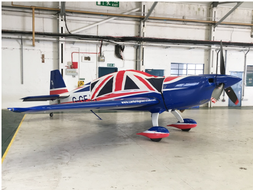
Extra 330 Canopy Cover, custom design

This cover type is made from Silver Acrylic Sunbrella canvas and is 100% lined with a soft and smooth microfiber. Bruce's Custom Covers developed this material combination especially for aircraft protection. The outer material is medium weight and treated for water resistance, UV resistance and anti-static buildup. The inner lining is a very soft and smooth microfiber to prevent scratching. The material is very reflective, and tests show that the cabin interior temperature can be reduced to near-ambient temperature on the hottest of days. It is water, ice and snow repellent, yet breathable to allow moisture to escape from between the cover and the aircraft surface.