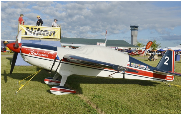
Extra 300 (mid-fuselage wing) Canopy Cover

This cover type is made from Silver Acrylic Sunbrella canvas and is 100% lined with a soft and smooth microfiber. Bruce's Custom Covers developed this material combination especially for aircraft protection. The outer material is medium weight and treated for water resistance, UV resistance and anti-static buildup. The inner lining is a very soft and smooth microfiber to prevent scratching. The material is very reflective, and tests show that the cabin interior temperature can be reduced to near-ambient temperature on the hottest of days. It is water, ice and snow repellent, yet breathable to allow moisture to escape from between the cover and the aircraft surface.