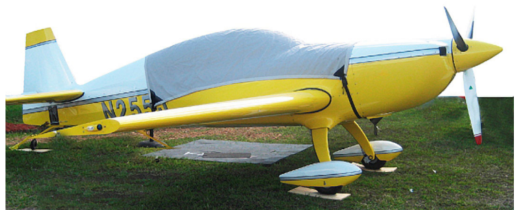
Extra 300L Canopy Cover