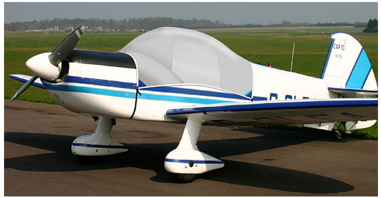
Mudry CAP 10 Canopy Cover (Illustration)