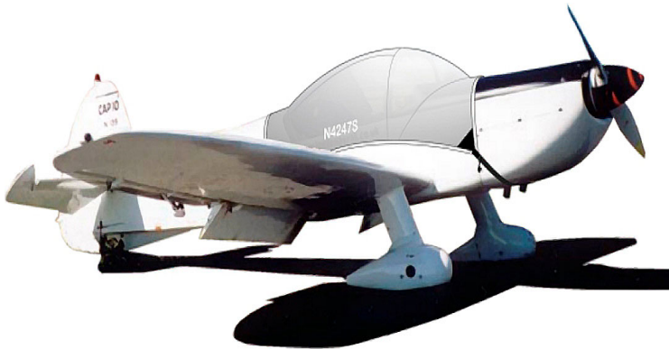
Mudry CAP 10 Canopy Cover (Illustration)

Travel Covers are made with Silver Solution-Dyed Polyester fabric and only lined over the windshield to save weight. The material is lightweight and more compact for easy stowage in the aircraft. The polyester material is water resistant, but only intended for occasional use outside. We also have an ultra lightweight material available for fitted hangar dust covers. For daily outdoor use, the non-travel Sunbrella Cover is the best choice.