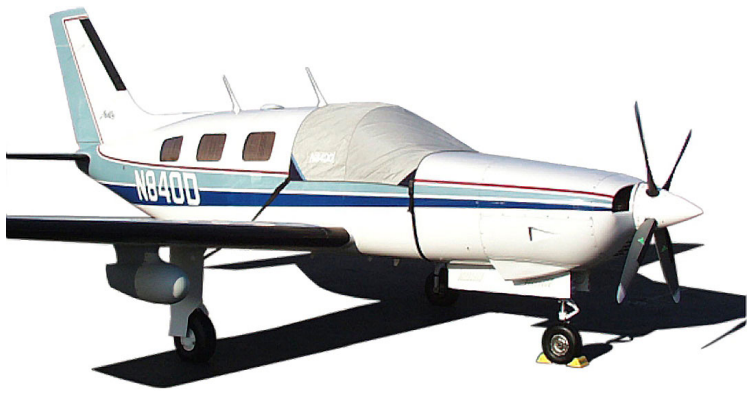
Piper Malibu/Mirage Windshield Cover