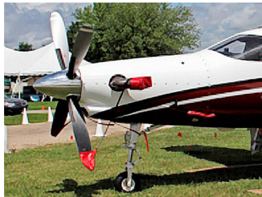
Epic Prop Tie-down/Exhaust cover set