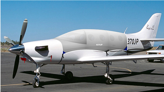
Epic LT Canopy Cover & Engine Plugs

Engine Inlet Plugs are custom fit for your Epic LT intakes, made with heavy-duty vinyl material, and stuffed with a single block of sculpted urethane foam. Each plug has a zipper that allows the foam to be removed and dried if necessary. Engine plugs have warning flags that are visible from the cockpit or 'remove before flight' streamers sewn onto the face of the plugs. Most plugs are imprinted with the aircraft registration number in black for an extra charge. Storage bag NOT included. Engine plugs may be inserted after flight when the engine is still warm. Engine Inlet Plugs are commonly referred to as Cowl Plugs, Intake Plugs, Cowl Blocks, Engine Blocks, and Engine Bungs.