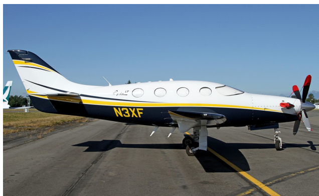
Epic LT Cockpit & Cabin HeatShields