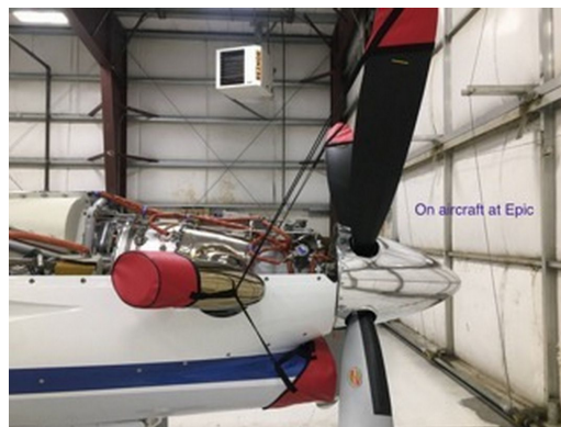
Epic Aircraft Prop Tie, Exhaust & Intake Covers