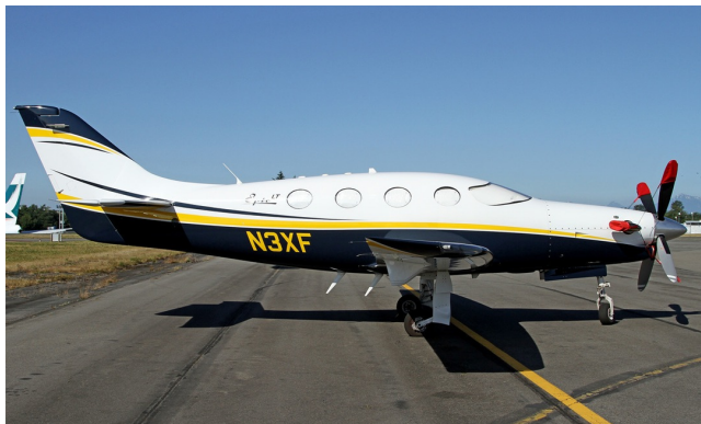
Epic LT Cockpit & Cabin HeatShields

This cover type is made from Silver Acrylic Sunbrella canvas and is 100% lined with a soft and smooth microfiber. Bruce's Custom Covers developed this material combination especially for aircraft protection. The outer material is medium weight and treated for water resistance, UV resistance and anti-static buildup. The inner lining is a very soft and smooth microfiber to prevent scratching. The material is very reflective, and tests show that the cabin interior temperature can be reduced to near-ambient temperature on the hottest of days. It is water, ice and snow repellent, yet breathable to allow moisture to escape from between the cover and the aircraft surface.