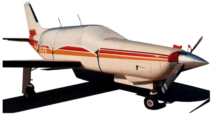
Malibu/Mirage/Meridian Standard Canopy Cover