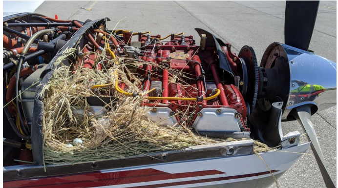
ENGINE PLUGS PREVENT BIRD NEST FOD. Piper Saratoga Engine Cowling Bird's Nest