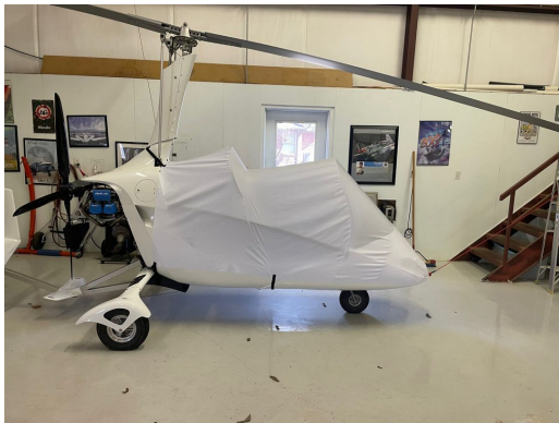
MTO Sport Gyrocopter Canopy/Nose Cover, test fit cover

Travel Covers are made with Silver Solution-Dyed Polyester fabric and fully lined over the entire cover. The material is lightweight and more compact for easy storage in the aircraft. The polyester material is water resistant, but only intended for occasional use outside. We also have an ultra lightweight material available for fitted hangar dust covers. For daily outdoor use, the non-travel Sunbrella Cover is the best choice.