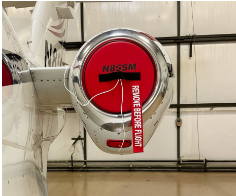
Eclipse EA500 Intake/Exhaust Plugs

necessary. Engine plugs have 'remove before flight' streamers sewn onto the face of the plugs. Most plugs are imprinted with the aircraft registration number in black for an extra charge. Storage bag NOT included. Engine plugs may be inserted after flight when the engine is still warm. Engine Inlet Plugs are commonly referred to as Cowl Plugs, Intake Plugs, Cowl Blocks, Engine Blocks, and Engine Bungs.