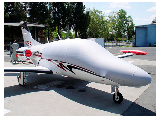
Eclipse EA500, TE500, 550 Travel Cover, Canopy/Nose Cover in Storage bag Eclipse Light Weight Travel Cover & Engine Plugs