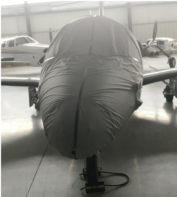
Eclipse EA550 Travel Canopy/Nose Cover

This cover type is made from Silver Acrylic Sunbrella canvas and is 100% lined with a soft and smooth microfiber. Bruce's Custom Covers developed this material combination especially for aircraft protection. The outer material is medium weight and treated for water resistance, UV resistance and anti-static buildup. The inner lining is a very soft and smooth microfiber to prevent scratching. The material is very reflective, and tests show that the cabin interior temperature can be reduced to near-ambient temperature on the hottest of days. It is water, ice and snow repellent, yet breathable to allow moisture to escape from between the cover and the aircraft surface.