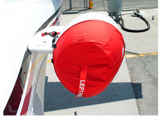
Eclipse Intake Cover & Pylon Wedge Plugs