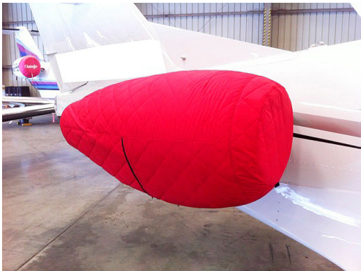
Eclipse Insulated Engine Cover

The Eclipse EA500, TE500, 550 Bikini Style Engine Covers are a single-piece design using a soft and smooth stretchy and fabric. The cover stretches tightly over both the intake and exhaust, installing quickly and easily. These covers are designed to be used as hangar dust covers and have a useful life of approximately one year.