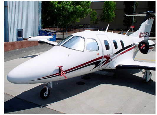
Cockpit HeatShields, Pitot Covers & "Bikini" style Engine Covers