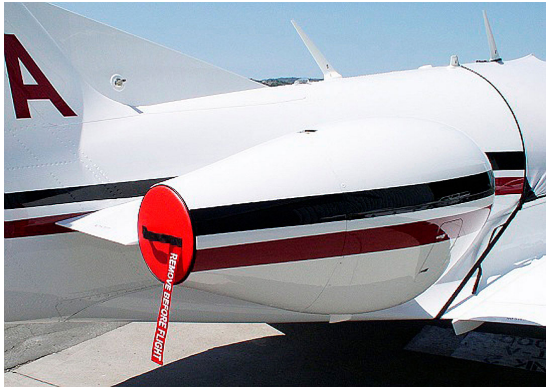
Eclipse Engine Exhaust Plugs set